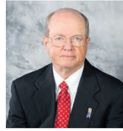
"Progress through Experienced Leadership" (931) 247-5113 rknowis@theknowisgroup.com

YARD SALE, 51 Deberry Court in Fredonia Village, Manchester. Thursday and Friday, 7a.m.-4p.m. Rain or shine.