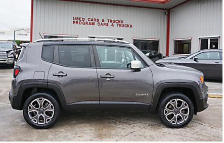
16 Jeep Renegade Limited