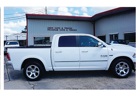
16 RAM 1500 Laramie

#11241.....$31,997 #11223.....$26,997 #8T0634A.....$24,997