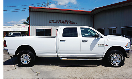
16 RAM 2500 Tradesman