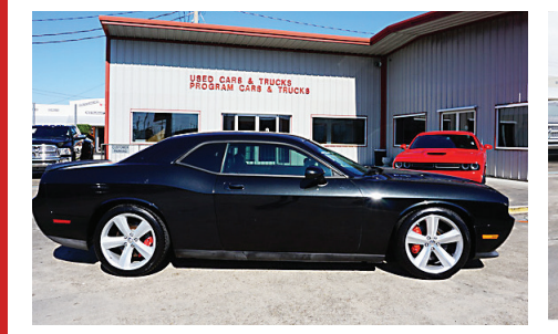
09 Dodge Challenger SRT8

#11241.....$31,997 #11223.....$26,997 #8T0634A.....$24,997