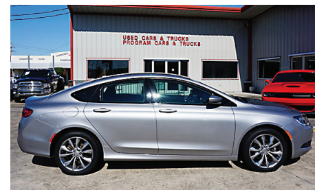
16 Chrysler 200S

#11271.....$21,997 #9D0124A.....$17,799 #9T0491A.....$13,997