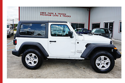
19 Jeep Wrangler Sport