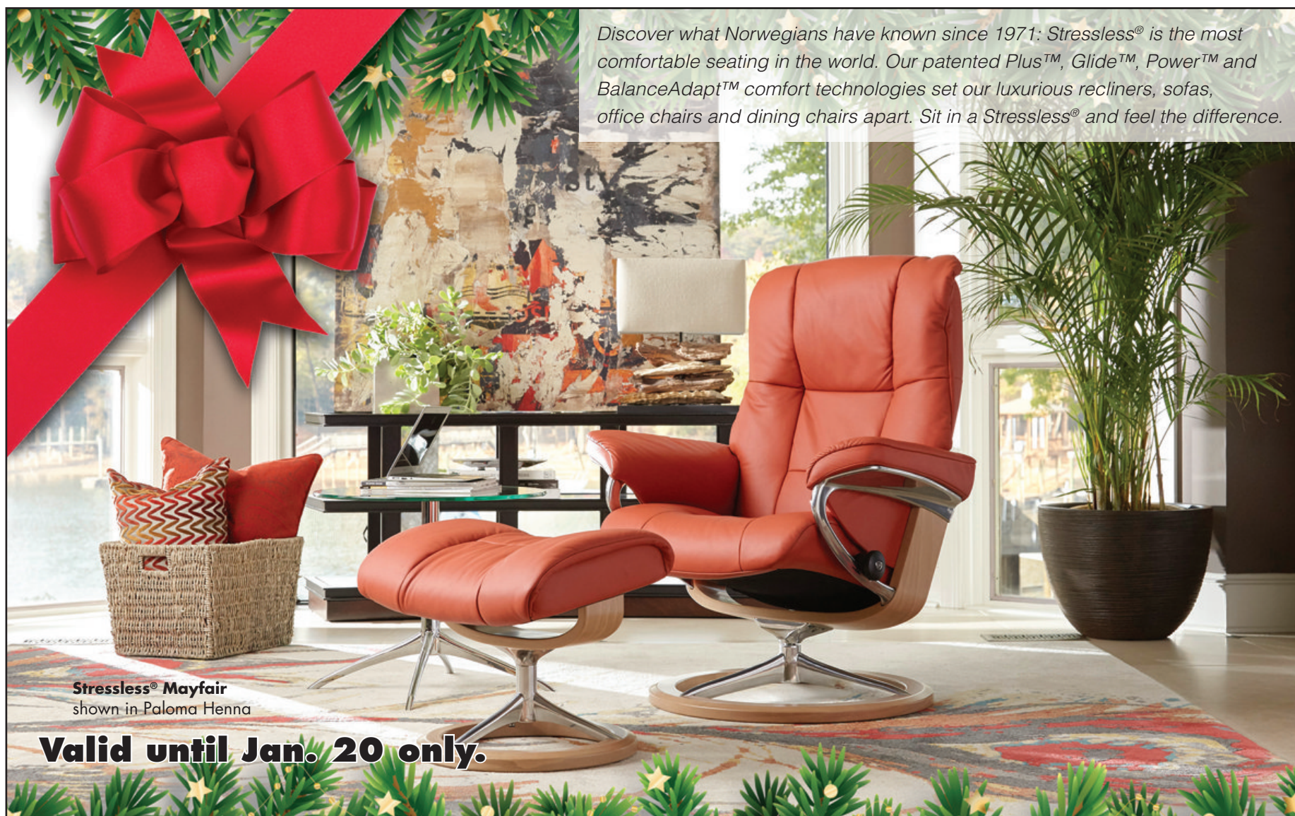
Stressless® Mayfair shown in Paloma Henna

Discover what Norwegians have known since 1971: Stressless® is the most comfortable seating in the world. Our patented Plus™, Glide™, Power™ and BalanceAdapt™ comfort technologies set our luxurious recliners, sofas, office chairs and dining chairs apart. Sit in a Stressless® and feel the difference.