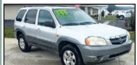
Stk.#CF1081R • $5,995 • $399 Down