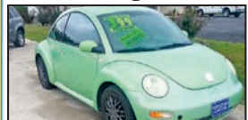
Stk.#CF2059R2 • $7,995 • $499 Down