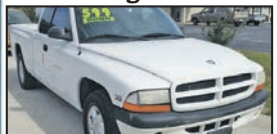
Stk.#2444R6 • $7,995 • $499 Down