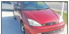
Stk.#CF2269 • $6,995 $399 Down