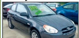
Stk.#4529R • $10,995 • $599 Down