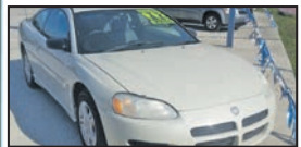
Stk.#4359A • $8,995 • $599 Down