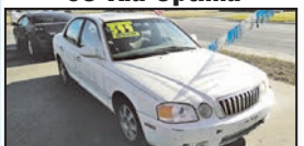
Stk.#3959R1 • $7,995 • $499 Down