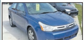
Stk.#4758 • $10,995 • $699 Down