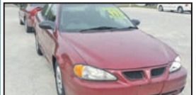
Stk.#5014 • $9,995 • $699 Down