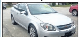
Stk.#5165 • $9,995 • $699 Down