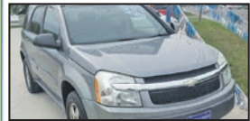
Stk.#4472R • $9,995 • $699 Down