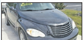
Stk.#3648R • $8,995 • $599 Down