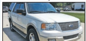
Stk.#4568R • $10,995 • $799 Down