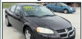
Stk.#4651R • $7,995 • $499 Down