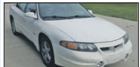
Stk.#5160 • $8,995 • $599 Down