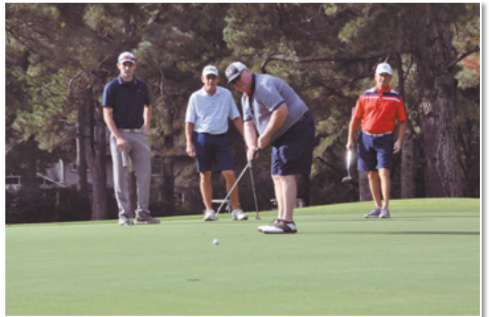
Gold Sponsor Burningtree Country Club played host to the Fall Golf Classic.