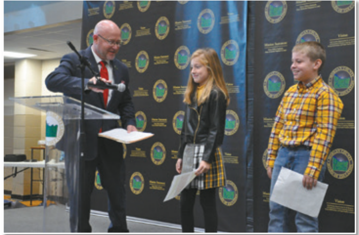
As is tradition for the Chamber's annual State of Morgan County Schools Address, students from across the district share their thoughts and experiences in their school communities with community and business leaders. The event is presented by the Morgan County Commission.