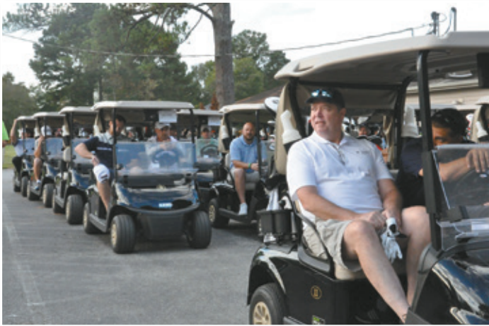
The Chamber welcomed 25 teams for the day-long Fall Golf Classic, presented by Valley Budweiser.