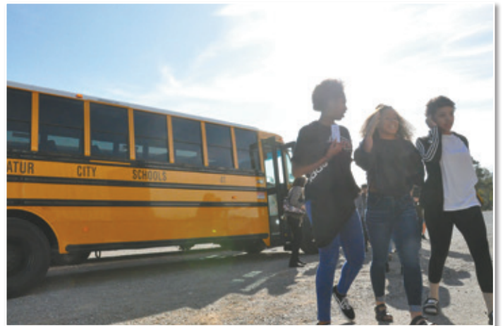
More than 2,500 eighth graders from Morgan and Limestone schools took part in the annual Endless Opportunities hands-on career and education event, presented by 3M of Decatur.