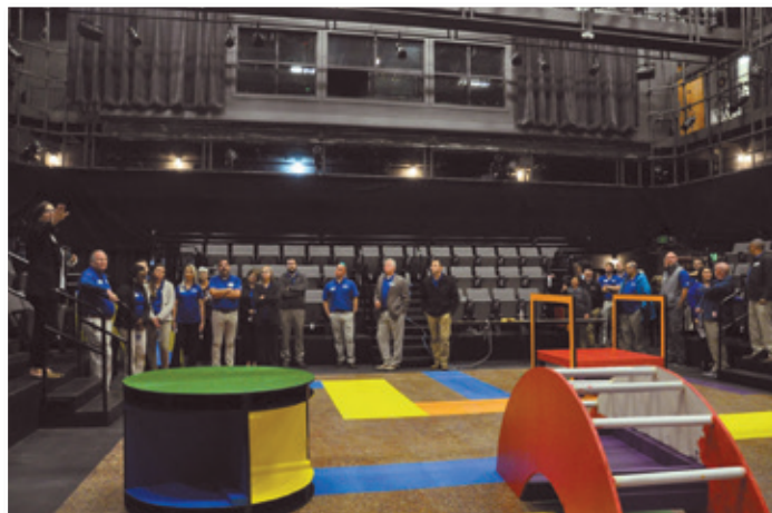
The Excellence class toured the Alabama Center for the Arts as part of their day focused on education.