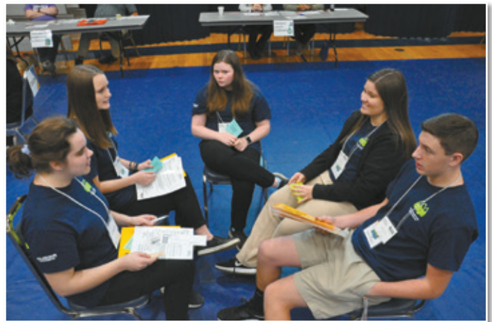
In November, Edge students participated as "family units" during the Poverty Simulation exercise.