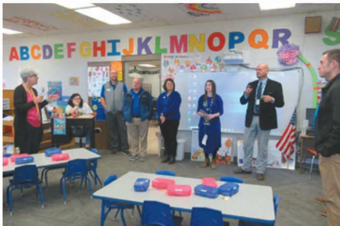
During the day focused on education, Excellence students visited the pre-school training facility during their tour of Brewer High School.