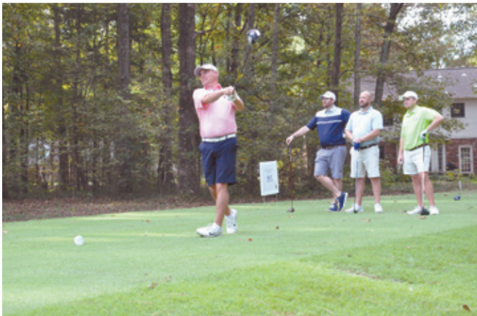
At more than 7,000 yards, Burningtree Country Club always presents quite a challenge for the Chamber's annual Fall Golf Classic.