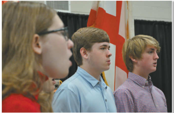
Members of the Decatur High School Chorus sang the National Anthem during the Chamber's annual State of Decatur City Schools Address.