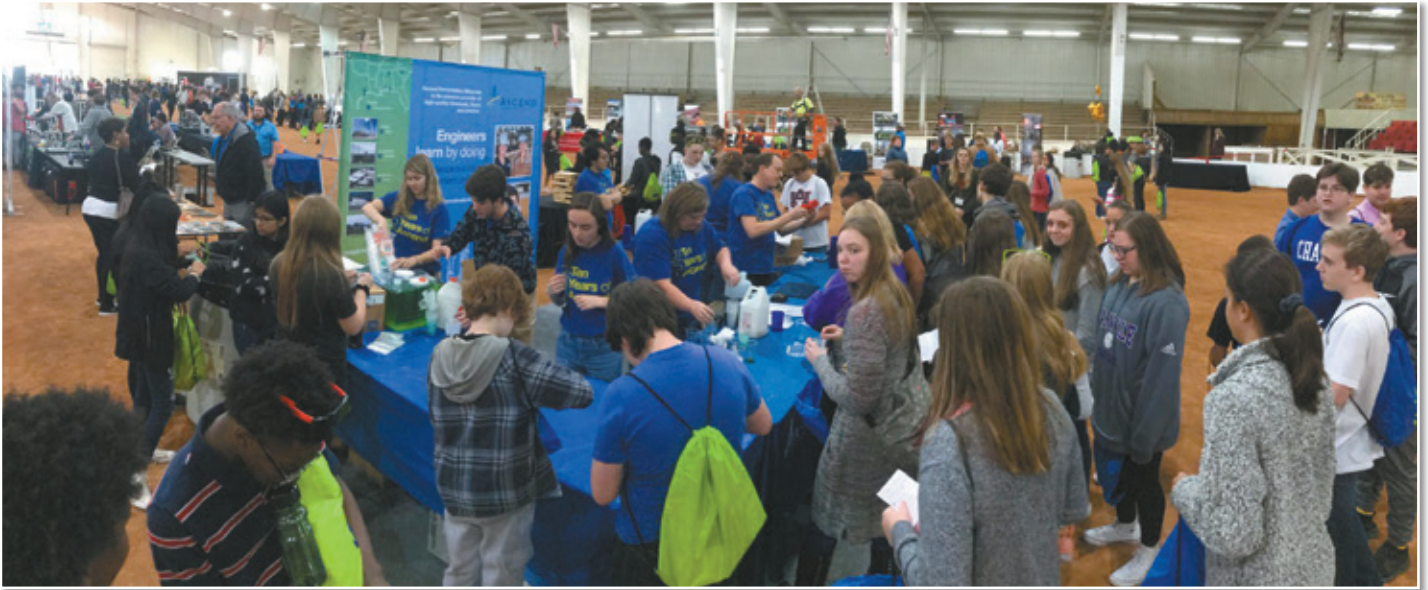
More than 2,500 eighth graders from Morgan and Limestone schools took part in the annual Endless Opportunities hands-on career and education event, presented by 3M of Decatur.