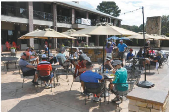
The Chamber is thankful for the hospitality of Gold Sponsor Burningtree Country Club for hosting the annual Fall Golf Classic.