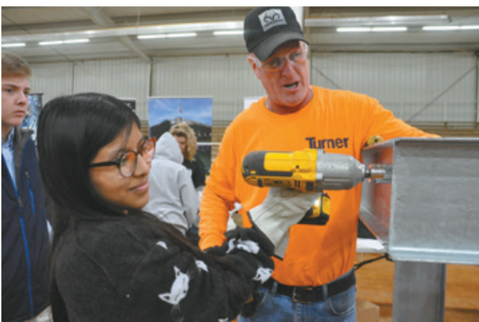
Young people interested in construction and trade careers are in high demand, which is an annual focus of the Chamber's workforce and talent development efforts. We are thankful for partners like 3M of Decatur for supporting events like Endless Opportunities.