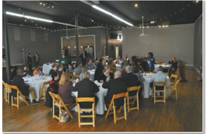
Business leaders from across north Alabama are regular attendees of the Chamber's quarterly Breakfast & Biz development sessions.