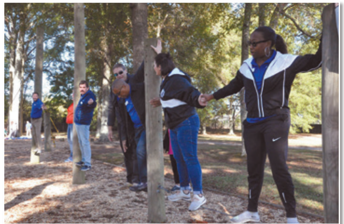
The Excellence class had to conquer challenges and establish a communication strategy during the October ropes course class.