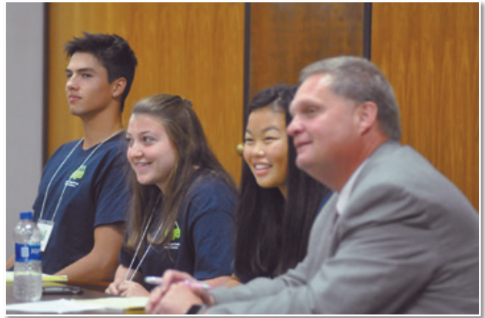
During the mock trial, students played each of the courtroom characters during Law & Order Day.