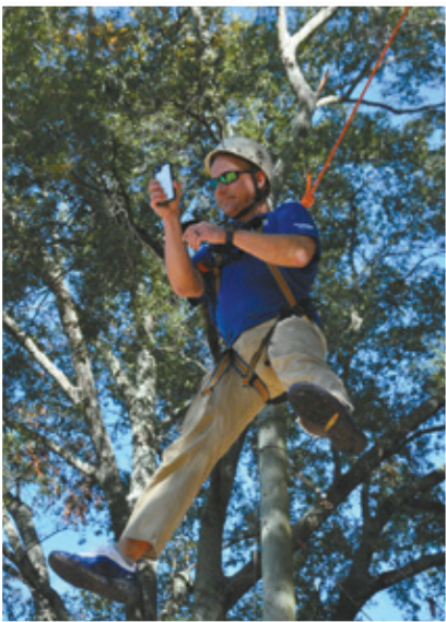
A student was able to capture his own image while suspended during the October ropes course class.