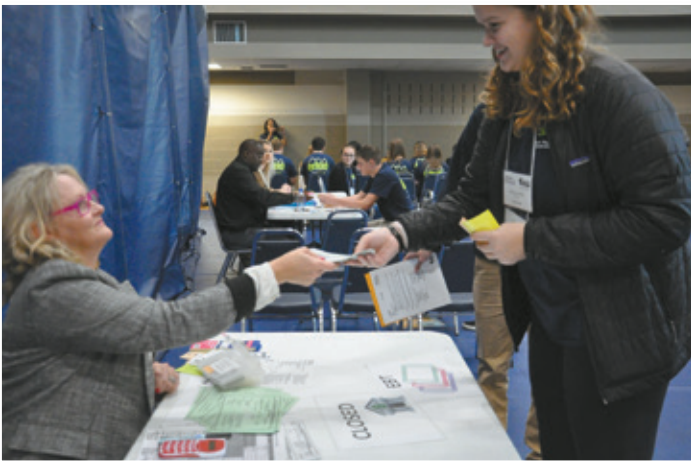
Edge students were required to move around the room and make family-dependent decisions based on a bare-bones budget.