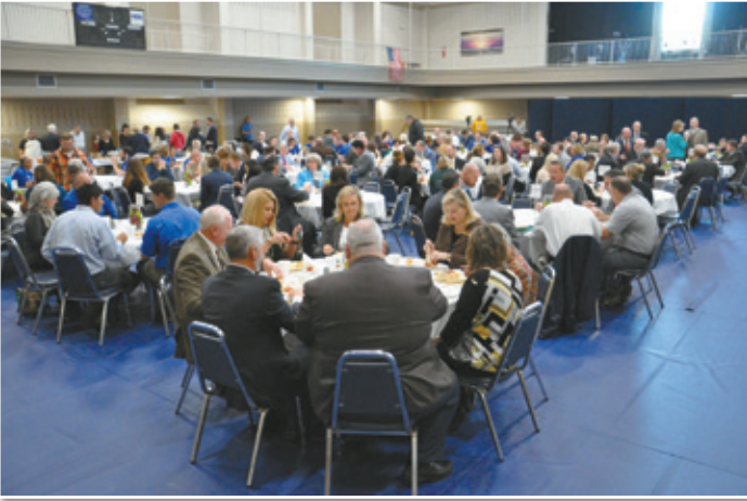
More than 200 community and business leaders from across north Alabama attended the Chamber's annual State of Morgan County Schools Address, presented by the Morgan County Commission.