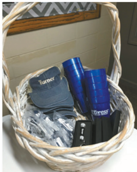
Events like the Fall Golf Classic are made possible by the generosity of sponsors like Express Employment Professionals and Turner, who served as our Beverage Cart Sponsors.