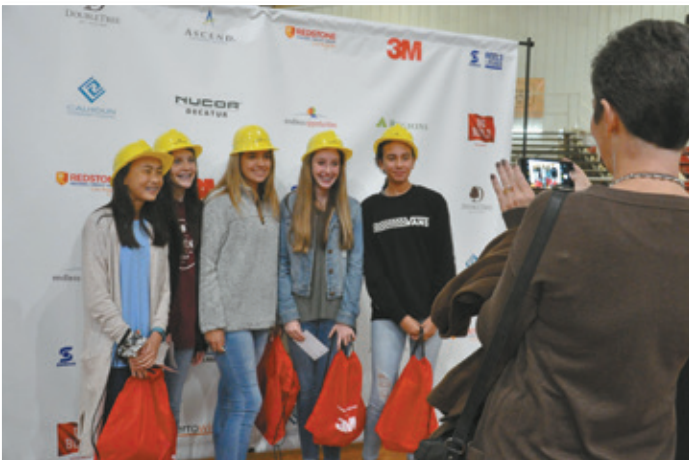
Students from Morgan and Limestone schools are able to have a “red carpet experience” during the annual Endless Opportunities hands-on career and education event, presented by 3M of Decatur.