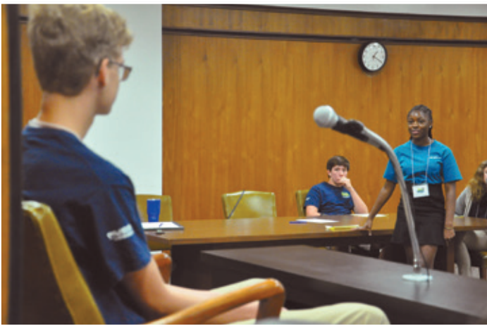
Edge students cross-examined their peers during the mock trial session.