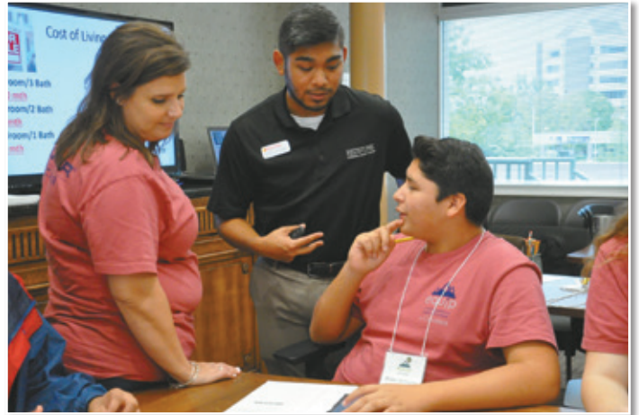
Students in the Equip program took part in a financial literacy workshop with area company Redstone Federal Credit Union.