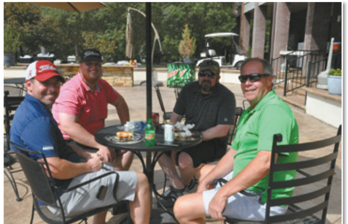
Networking events like the annual Fall Golf Classic provide members the opportunity to connect with other business and community leaders from the Decatur-Morgan County area.