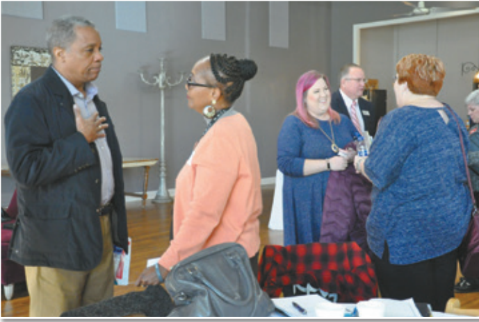
Breakfast & Biz is a networking opportunity for business and community leaders to connect and discover shared interests and goals for their businesses.