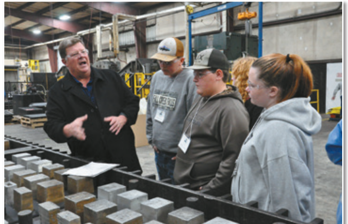
The goal of the Equip program is to serve young people and help them make wise decisions early to shape their futures.

who owned a check cashing business, a healthcare provider, a parole officer, a childcare center director and so on. Students had to learn about prioritizing topics like healthcare, childcare, education, rent and other real-world issues for working families. The Chamber is thankful for Leadership Huntsville for partnering on the poverty simulation event. The presenting sponsor for Edge is Nucor Steel Decatur .