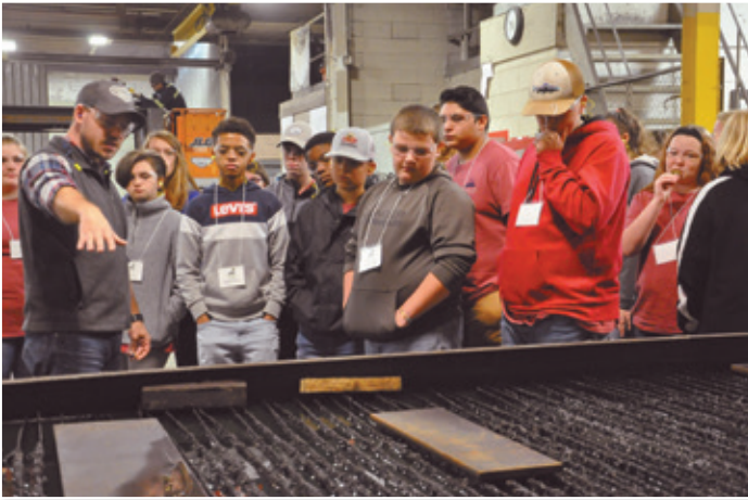
Equip students in October focused on skilled trades and toured the Decatur headquarters of Contractor Service and Fabrication Inc.