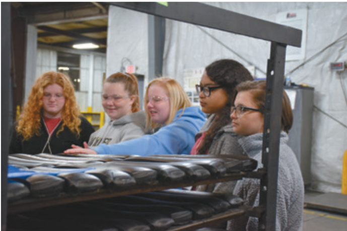
In November, the Equip class visited Valley Rubber of Falkville to discuss synthetic rubber production and the value of investing in your staff.