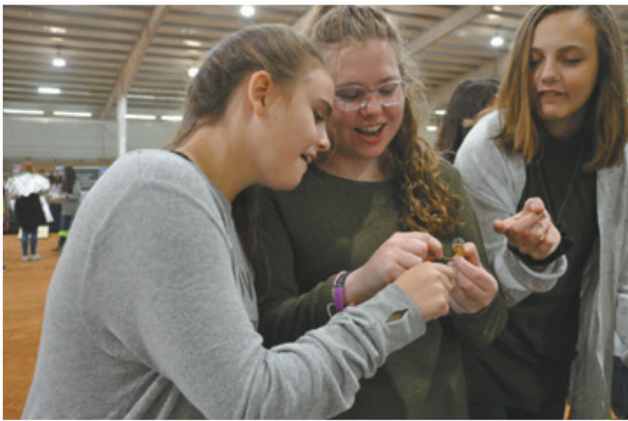
Learning about electricity and circuitry is critical in facing the shortage of skilled electricians in our area, an issue highlighted during the annual Endless Opportunities hands-on career and education event, presented by 3M of Decatur.