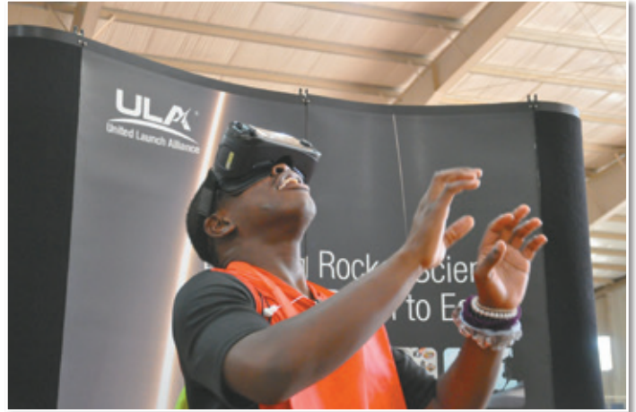
Strategic Partner United Launch Alliance let students wear their virtual reality (VR) launch simulator during the annual Endless Opportunities hands-on career and education event, presented by 3M of Decatur.