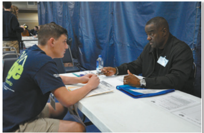
Community volunteers took part in the Edge Poverty Simulation, helping to guide the students into making smart decisions while being accountable for how you spend your money.