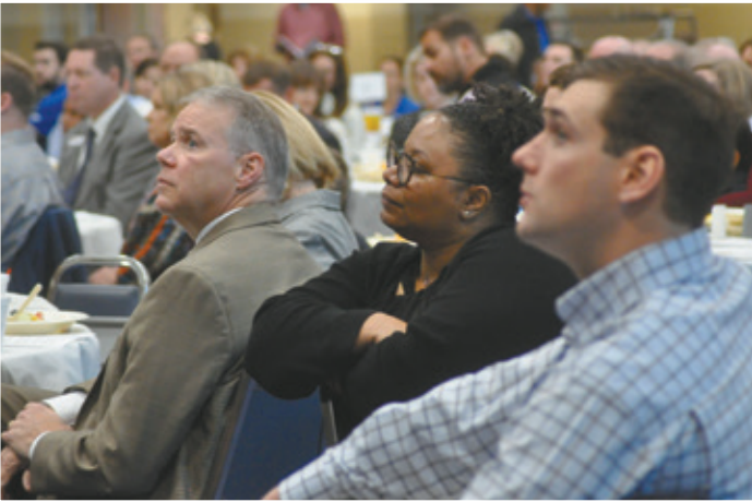
More than 200 community and business leaders from across north Alabama attended the Chamber's annual State of Morgan County Schools Address, presented by the Morgan County Commission.