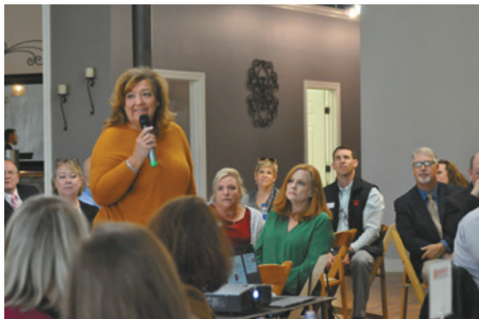
During Breakfast & Biz development sessions, attendees have the opportunity to introduce themselves to the room and provide their “elevator pitch” about their business.