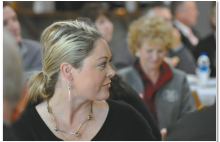
More than 60 business and community leaders attended the fall Breakfast & Biz development session discussing social media trends for 2020.