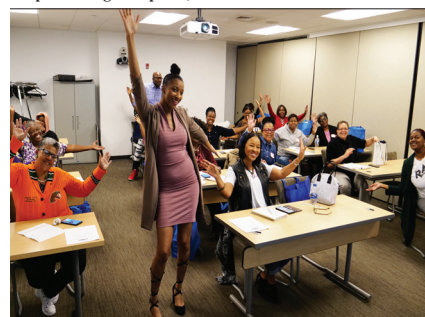
Entrepreneurs and aspiring entrepreneurs attended a Mind Your Business seminar on Saturday, October 5, 2019 at Coppin State University's Physical Sciences Center. The event included morning and afternoon breakout sessions led by PVC Bank, Times Community Services, Inc., and The Baltimore Times. The event included morning and afternoon breakout sessions led by PVC Bank, Times Community Services, Inc., and The Baltimore Times. The event included morning and afternoon breakout sessions led by PVC Bank, Times Community Services, Inc., and The Baltimore Times. The event included morning and afternoon breakout sessions led by PVC Bank, Times Community Services, Inc., and The Baltimore Times. (See article on page 14)