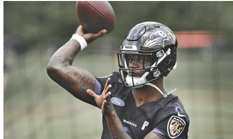
Baltimore Raven Quarterback, Lamar Jackson