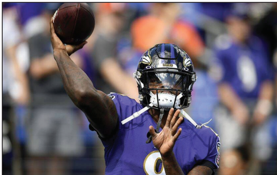
Lamar Jackson, Baltimore Ravens Quarterback

Jackson led the Ravens on numerous late drives to win games this season.