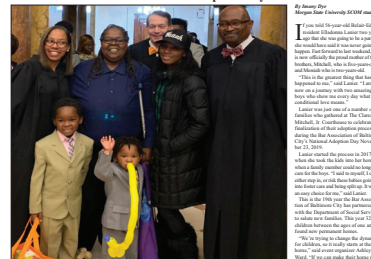
Thirty-two children in Baltimore celebrated 'forever' families on National Adoption Day on November 29, 2019. The event was held at the Baltimore Museum of Industry and was sponsored by the Baltimore Museum of Industry, the Baltimore Times, and the Baltimore Times. (See article on page 14)