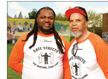
Penn North residents welcomed Youth Advocate Programs' Safe Streets Team on August 18, 2019. The team is dedicated to reducing gun violence in the community. (See article on page 14)