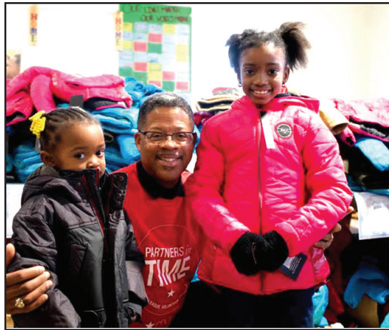
The coat distribution event benefitted Legal Aid, and took place at the Boys & Girls Club of Metropolitan Baltimore. The Club is located at 3560 3rd Street in Brooklyn, MD. According to Macy's, 500 coats were distributed.