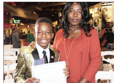
Twenty-two children became America's newest citizens at Baltimore Museum of Industry ceremony on October 12, 2019. Above was one of 22 children from 17 different countries who obtained U.S. citizenship through their parents. Some were adopted by U.S. citizen parents, and others earned citizenship when their immigrant parents became naturalized citizens. (Story on page 14)