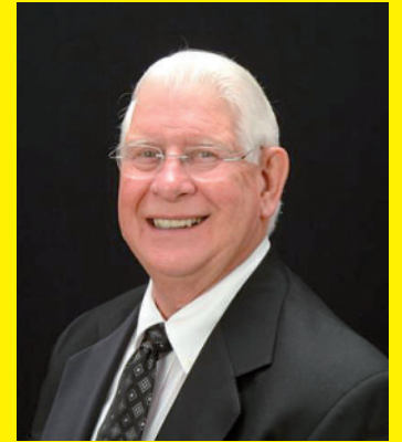
Call Ken Cassell

Choose One of Our Wooded Lots -or- We Can Build on Your Lot