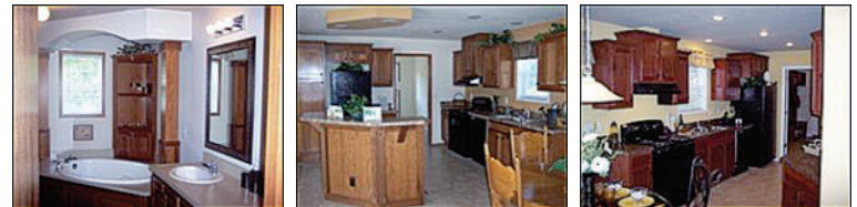
Forest River Housing – Model #156 with optional porch. 3BR, 2B home