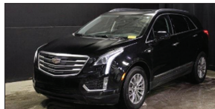
2017 Cadillac XT5 AWD Luxury