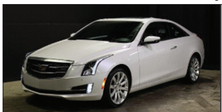
2017 Cadillac ATS AWD Luxury