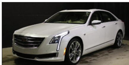
2018 Cadillac CT6 Platinum AWD