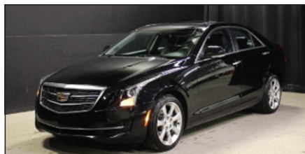
2016 Cadillac ATS AWD Luxury