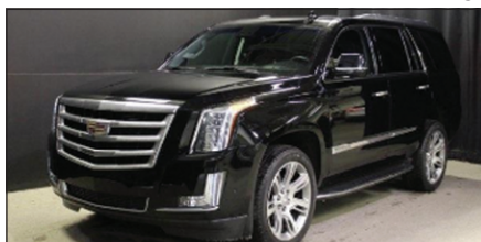
2017 Cadillac Escalade 4WD Luxury