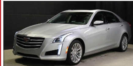
2016 Cadillac CTS AWD Luxury