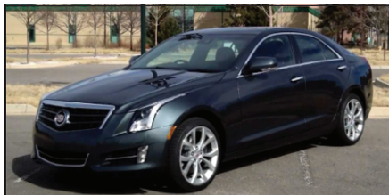
2013 Cadillac ATS 2.0L Turbo Performance