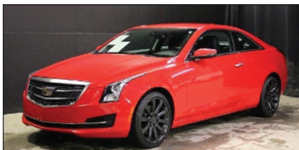
2016 Cadillac ATS AWD