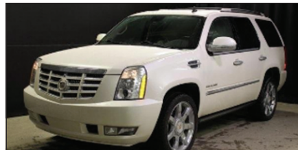
2011 Cadillac Escalade AWD