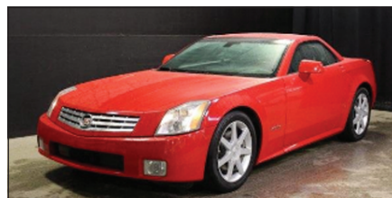
2007 Cadillac XLR Convertible