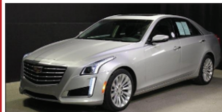
2017 Cadillac CTS Luxury