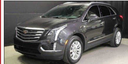
2017 Cadillac XT5 FWD