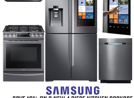
SAVE 10% ON A NEW 4 PIECE KITCHEN PACKAGE *With Approved Credit. See store for details.