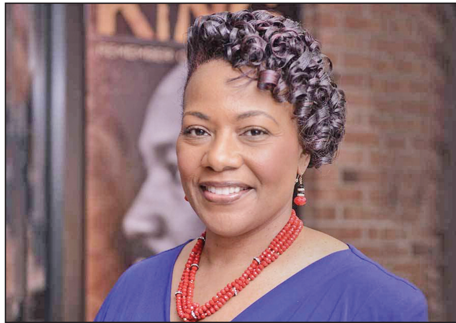
Beatrice King, the daughter of Dr. Martin Luther King, Jr. has led the mission of The King Center in Atlanta where she continues her father's mission of freedom and justice for all.

Another recent post by King that featured a photo of both Dr. King and his wife, Coretta Scott King, marching in the South, was accompanied by the late leader's quote: "Our nettlesome task is to discover how to organize our strength