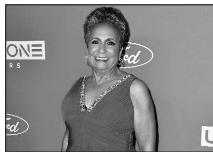
Cathy Hughes on the red carpet at the 40th Anniversary celebrations of Urban One, Inc.

She began her career in 1969 at an AM radio station in her native Omaha, but left for Washington, D.C. when she was offered a job as a lecturer at Howard University. In 1973, Hughes was named general sales manager of WHUR, Howard's FM radio station. Two years later, Hughes was promoted to general manager. There she created the late night, slow-jam formatted staple called "The Quiet Storm" a signature sound that expanded to radio stations around the country. In that short time, Hughes had taken annual revenues at the station from $250,000 to more than $3.5 million.