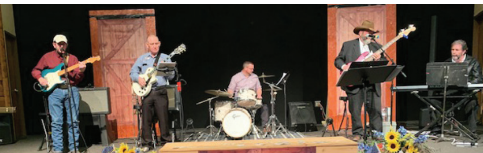
The Running Creek Band