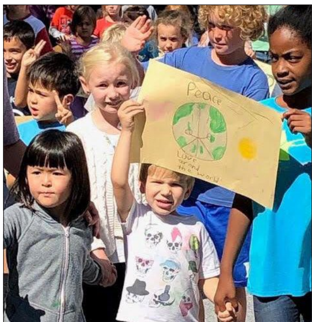
WEST CHESTER FRIENDS SCHOOL

West Chester Friends School's youngest students explore enriched art-, literature- and play-based experiences rooted in the Quaker values of simplicity, peace, integrity, community, equality and stewardship.