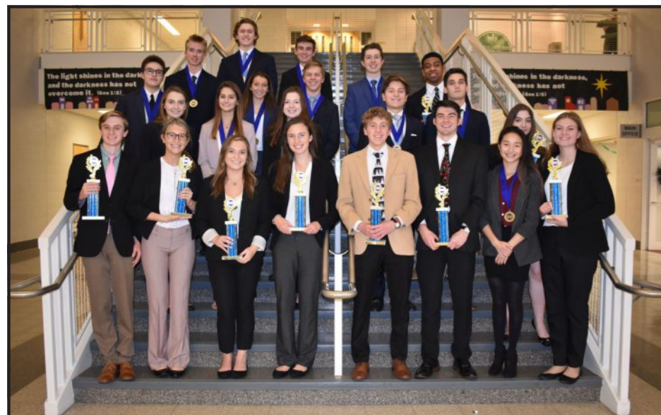
Bishop Shanahan High School students have been recognized as confident scholars, able leaders and critical thinkers in a rapidly evolving global world.

Come and see for yourself what DECA and BSHS is all about. There are many opportunities to visit before the 2019-2020 school year is finished. Seventh-grade students are invited to Visitation Day on Wednesday, March 11 from 8:30 a.m. to 1:30 p.m. Eighth-grade students are welcome to participate in a Shadow Day through May. Students of all ages and their families are welcome to the spring open house on Wednesday, April 1 from 7 to 9 p.m. Learn more at www.shanahan.org .