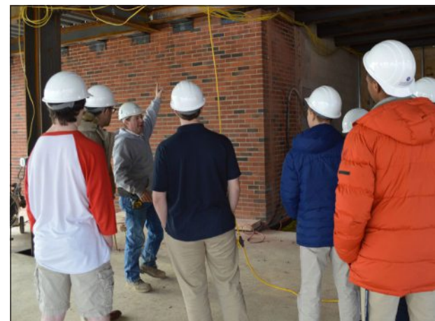
Woodlynde School is undergoing a dramatic campus transformation.

Founded in 1976 and located in Strafford, Chester County, Woodlynde School welcomes and serves stu-