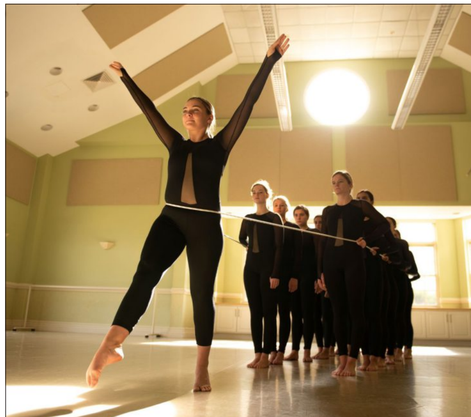
The Academy of Notre Dame de Namur in Villanova offers students a comprehensive, curricular dance program.

To learn more about the arts at Notre Dame, visit www.ndapa.org .