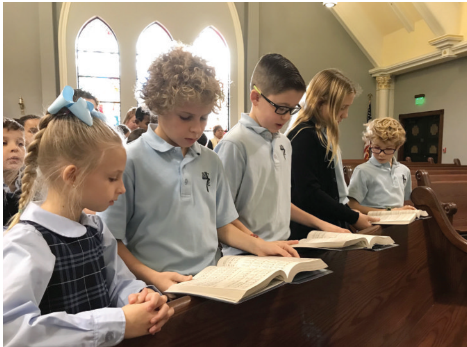
At St. Teresa of Calcutta Education Center, we go to great lengths to ensure we are the perfect fit for your family.

Parents have many factors to consider when choosing a school for their child.