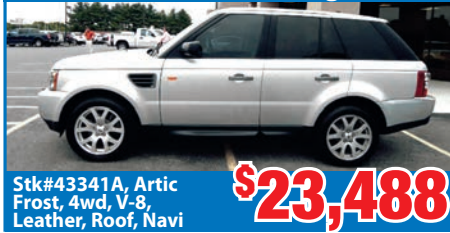
Stk#43341A, Artic Frost, 4wd, V-8, Leather, Roof, Navi $23,488