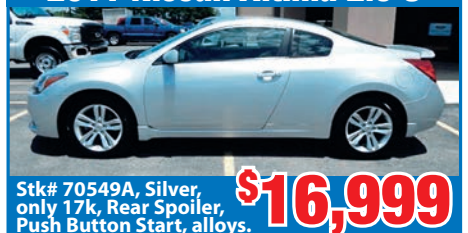
Stk# 70549A, Silver, only 17k, Rear Spoiler, Push Button Start, alloys. $16,999