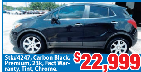
Stk#4247, Carbon Black, Premium, 23k, Fact Warranty, Tint, Chrome. $22,999