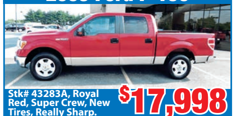
Stk# 43283A, Royal Red, Super Crew, New Tires, Really Sharp. $17,998