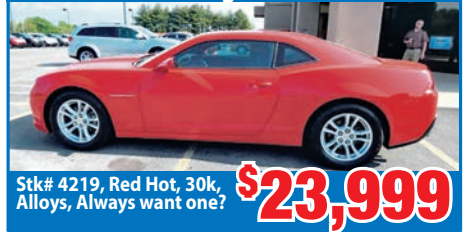
Stk# 4219, Red Hot, 30k, Alloys, Always want one? $23,999