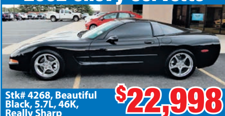
Stk# 4268, Beautiful Black, 5.7L, 46K, Really Sharp $22,998