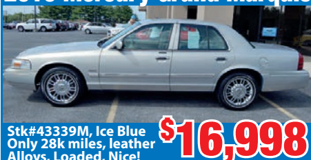
Stk#43339M, Ice Blue Only 28k miles, leather Alloys, Loaded, Nice! $16,998