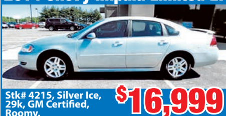
Stk# 4215, Silver Ice, 29k, GM Certified, Roomy. $16,999