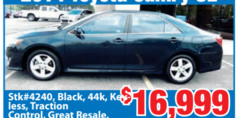
Stk#4240, Black, 44k, Keyless, Traction Control, Great Resale. $16,999