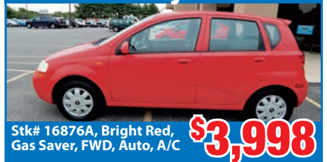
Stk# 16876A, Bright Red, Gas Saver, FWD, Auto, A/C $3,998