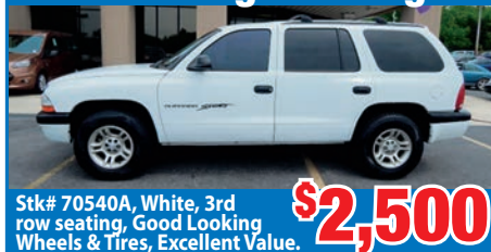
Stk# 70540A, White, 3rd row seating, Good Looking Wheels & Tires, Excellent Value. $2,500