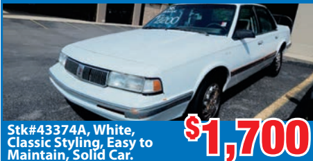
Stk#43374A, White, Classic Styling, Easy to Maintain, Solid Car. $1,700