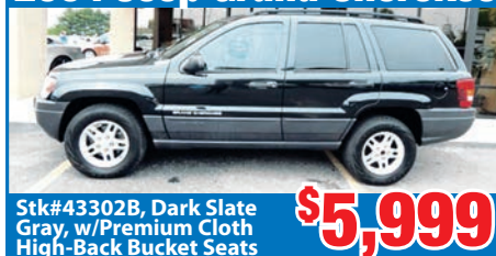
Stk#43302B, Dark Slate Gray, w/Premium Cloth High-Back Bucket Seats $5,999