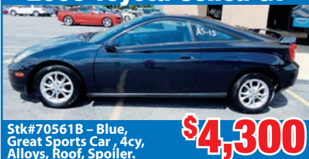
Stk#70561B - Blue, Great Sports Car, 4cy, Alloys, Roof, Spoiler. $4,300