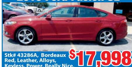
Stk# 43286A, Bordeaux Red, Leather, Alloys, Keyless, Power, Really Nice. $17,998