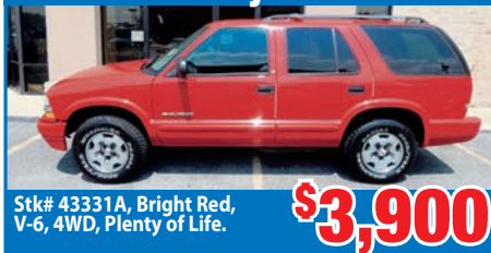
Stk# 43331A, Bright Red, V-6, 4WD, Plenty of Life. $3,900