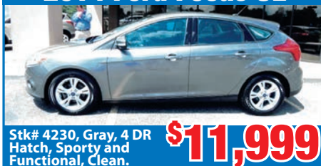
Stk# 4230, Gray, 4 DR Hatch, Sporty and Functional, Clean. $11,999