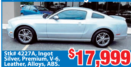
Stk# 4227A, Ingot Silver, Premium, V-6, Leather, Alloys, ABS. $17,999