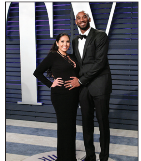
Vanessa Laine Bryant and Kobe Bryant attend the 2019 Vanity Fair Oscar Party at Wallis Annenberg Center for the Performing Arts on February 24, 2019, in Beverly Hills, California.

"I, along with millions of others around the world, mourn the tragic passing of