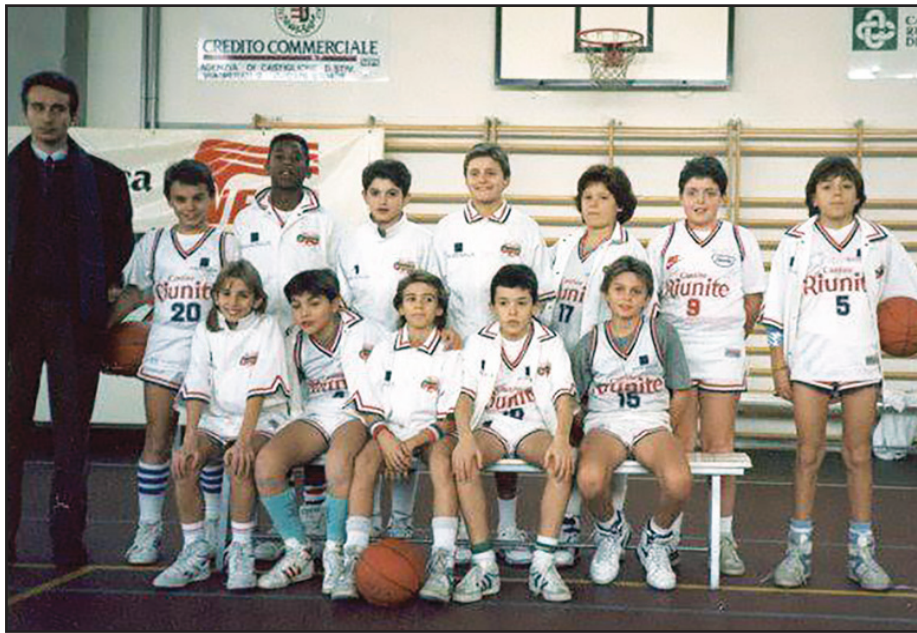
Kobe Bryant's 'Cantine Riunite' youth team in the early 1990's in Reggio Emilia, Italy. Bryant is in the top row, third from the left.