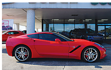
2016 Chevrolet Corvette Stingray Z51 3LT