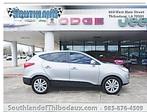
SouthlandofThibodaux.com | 985-876-4509

2016 FORD FUSION SE, 95,528 miles, $11,997. 985-876-1817