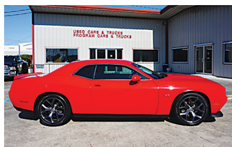
2019 Dodge Challenger R/T Rare Color