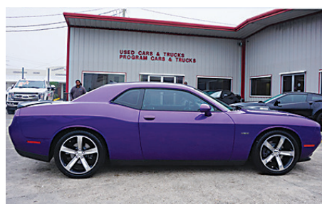
2019 Dodge Challenger R/T Rare Color