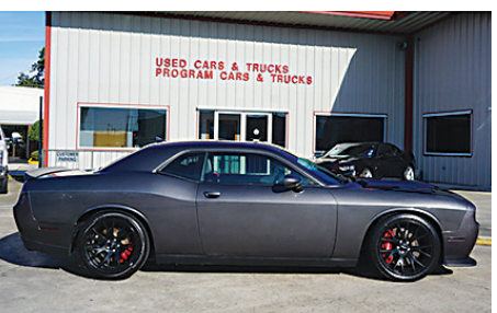
2016 Dodge Challenger SRT Hellcat Rare Engine