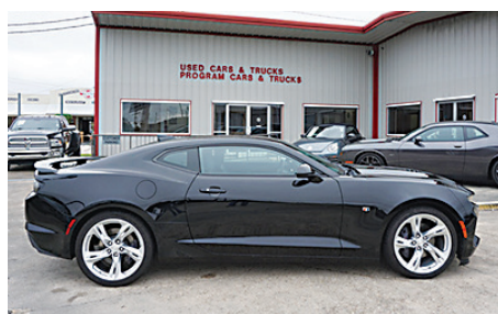
2019 Chevrolet Camaro SS W/2SS