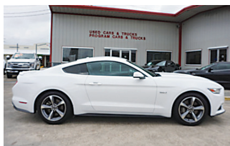
2016 Ford Mustang GT

PREGNANT? CONSIDERING ADOPTION? Call us first. Living expenses, housing, medical and continued support afterwards. Choose adoptive family of your choice. Call 24/7 1-855-780-8359 (LA-SCAN)