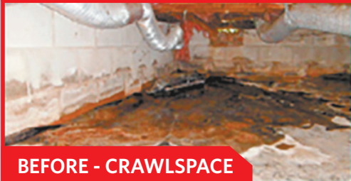
BEFORE - CRAWLSPACE

DON'T LET LITTLE SYMPTOMS BECOME HUGE PROBLEMS