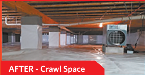
AFTER - Crawl Space