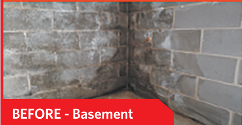
BEFORE - Basement