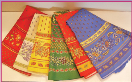
French Provence Tablecloths

QUALITY GIFTS FROM ACROSS THE USA AND AROUND THE WORLD.