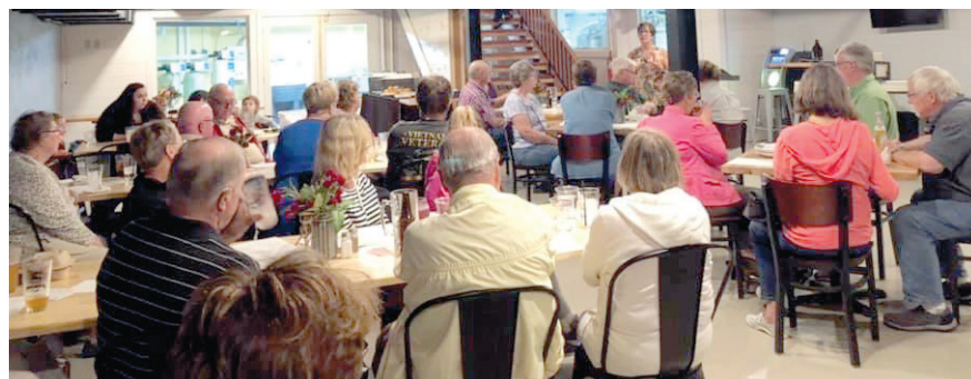
The Bible and Brew crew on a recent Wednesday evening at Block North in Aitkin.

By ANN SCHWARTZ In the Greatest Generation — those Americans who came of age during the Great Depression and World War II — about 70 percent of families attended church regularly.