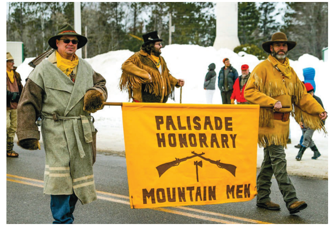
Mountain Men in their finery leading the parade at the Palisade MidWinter Festival on February 3. Festivities also included a breakfast fundraiser at the Rustic, the chance to visit the Mountain Man Fort north of town, music, raffles and Lions Club Poker.