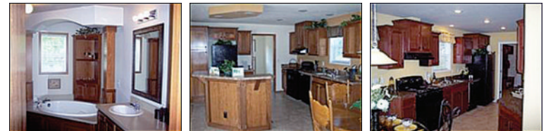
Forest River Housing – Model #156 with optional porch. 3BR, 2B home