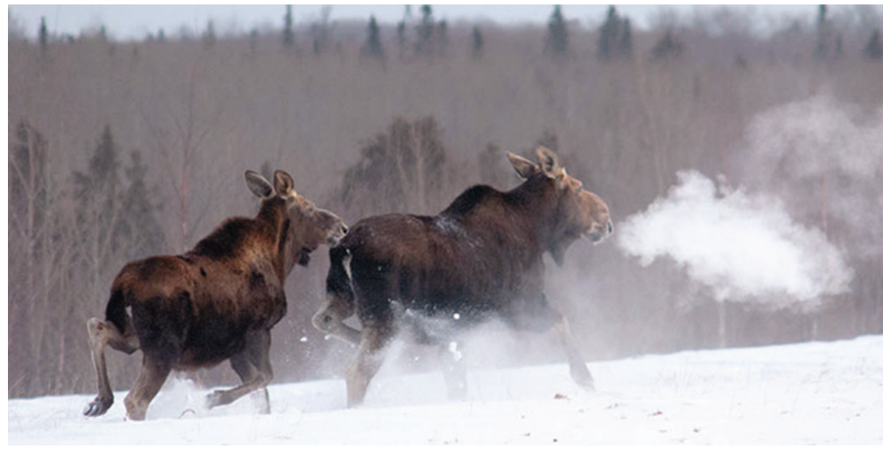
For the ninth year in a row, Minnesota's moose population remains relatively stable, but reproductive

cause biologists cannot see or count every moose across the 6,000-square mile survey area. They survey a portion of the moose range every year to generate the estimate.