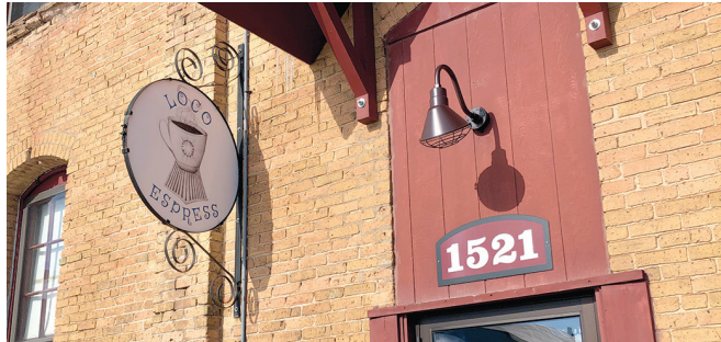
The Loco Espresso Coffee House and Boutique is nestled in the Clock Tower building of the brick-clad NP Center in Brainerd.

This writer made the trek to her old stopping grounds (from which the trains lulled her to sleep at night in Northeast Brainerd). The Shop Whistle blew at various times of day, signaling