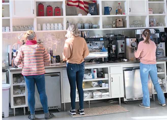
A glimpse of the industrial-chic-farmhouse-patriotic décor of Loco Espresso, while staff bustle about getting orders ready.

items are the Loco Coco, Runaway Train latte, The Highball latte, The Trolley latte, cold brew, pour-overs, a large assortment of teas and many other options. As far as food we have Avocado Toast, bagels, an Ezekiel Muffin with blueberry-vanilla goat