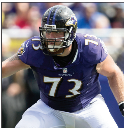
Marshal Yanda has announced his retirement after 15 years with the Baltimore Ravens in the NFL

Being named an All-Fundamentals Team player meant Yanda received an