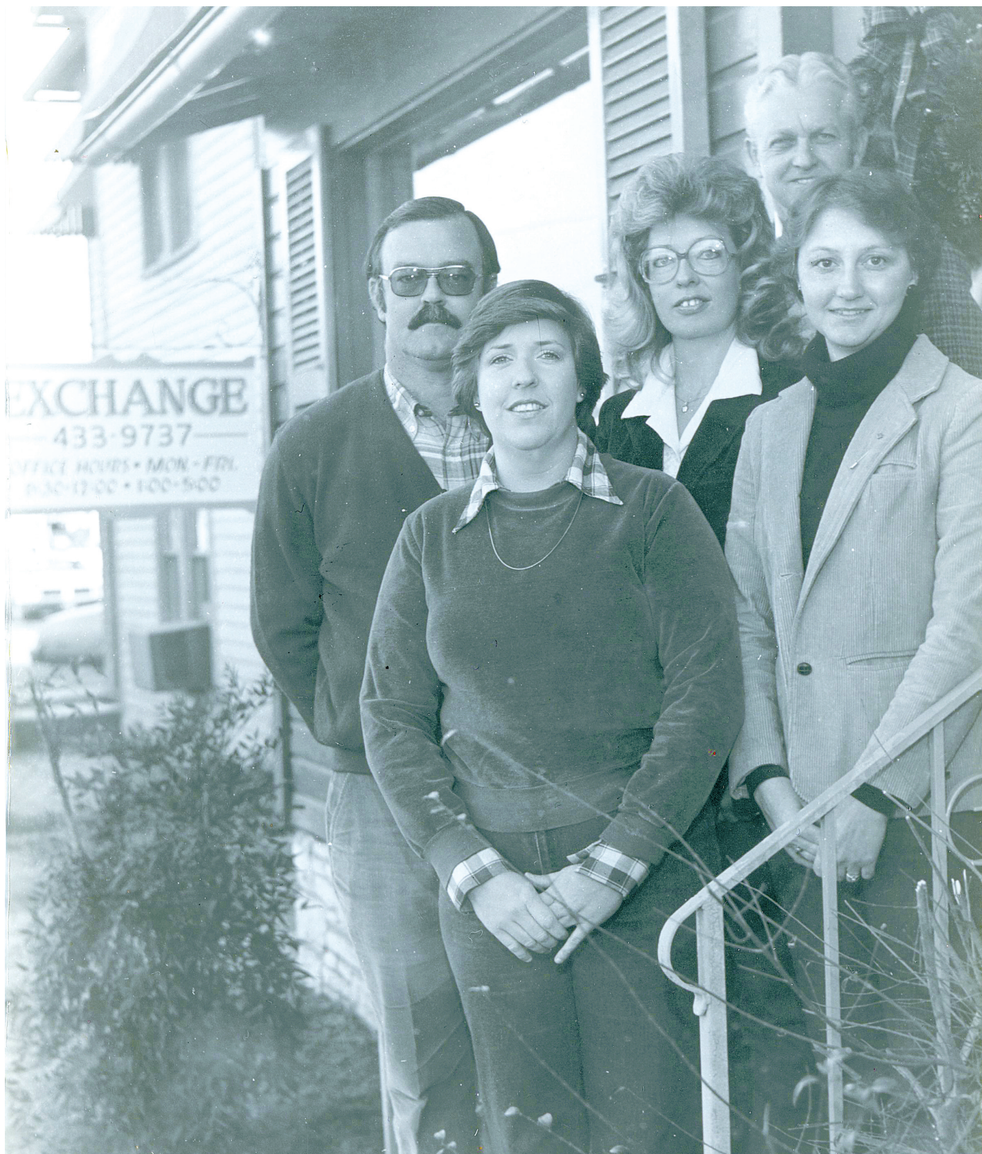
1981 Exchange Team

Our company was founded to help you “buy, sell and trade”. We continue to carry forward that founding idea.