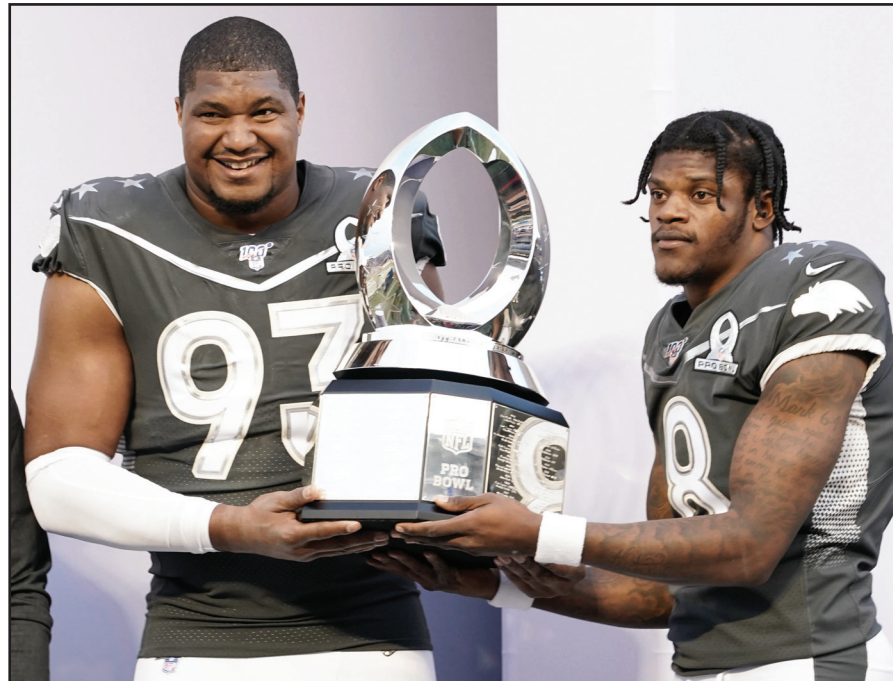
Calais Campbell has agreed to a two-year, $27 million contract extension with the Baltimore Ravens after a trade with the Jacksonville Jaguars for a fifth-round pick in the 2020 NFL Draft. (Above) The 2020 Pro Bowl Defensive MVP Calais Campbell and Offensive MVP Lamar Jackson holding the MVP trophy.

Campbell will blow up plays in the backfield by getting to the quarterback and