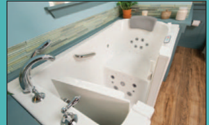
44 Hydrotherapy Jets