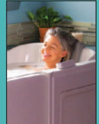
Comfort & Safety