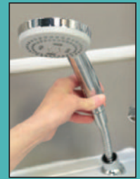
Hand Held Shower