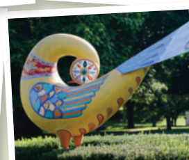
See the Distelfink!