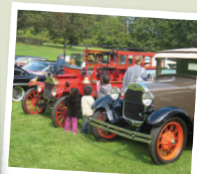
Attend a Festival!