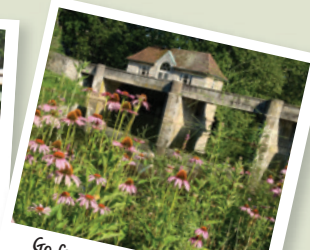
Go for a Bike Ride or Walk.