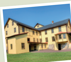
Tour the Gruber Wagon Works.