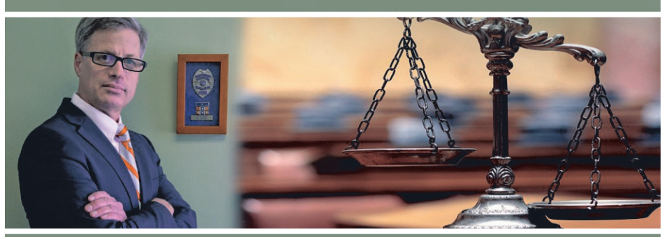
Note our New Address

• Divorce & Family • Personal Injury • Wills Estates & Trusts