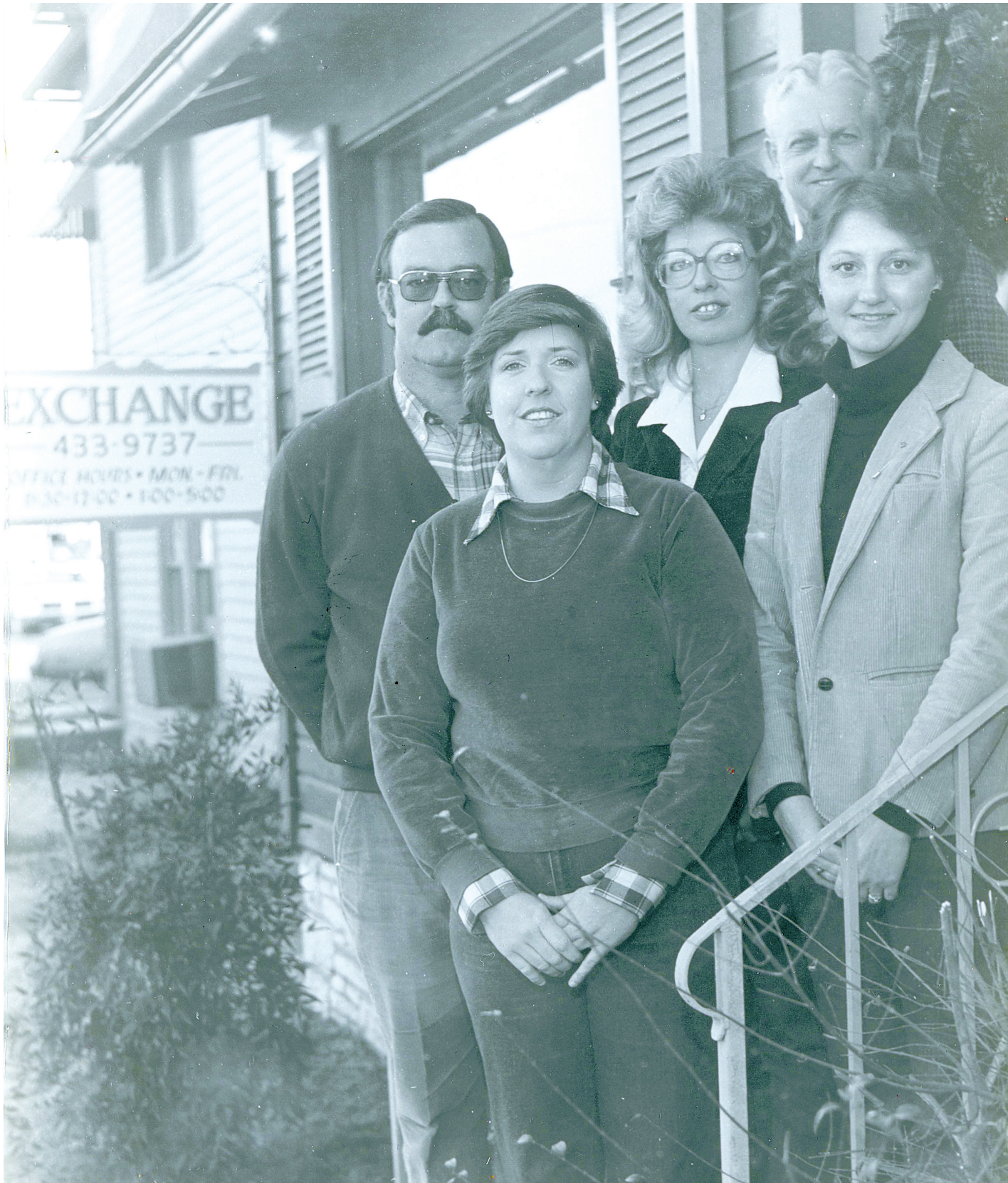
1981 Exchange Team

Our company was founded to help you “buy, sell and trade”. We continue to carry forward that founding idea.