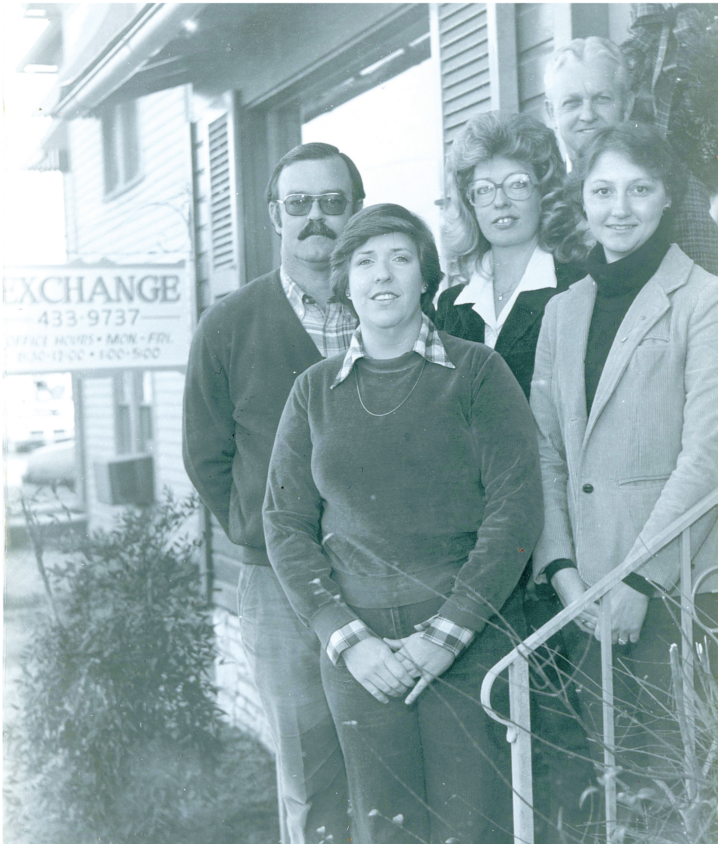
1981 Exchange Team

Our company was founded to help you “buy, sell and trade”. We continue to carry forward that founding idea.