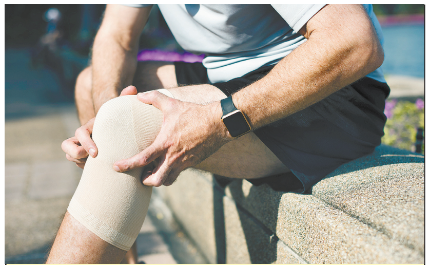
Study shows this treatment was successful in 75% of knee arthritis pain sufferers... saving them from surgery for at least 7.3 years. Will it work for you? Find out for FREE