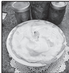
Easter tradition Coconut Meringue Pie

As humans, Easter time can be bittersweet even as we celebrate the joy of knowing our Savior, Jesus Christ. May our memories move us to recognize our blessings as we find them, brightly scattered all about us! Til next week, lets watch for further signs of Spring!