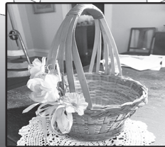
Easter basket my mom decorated.