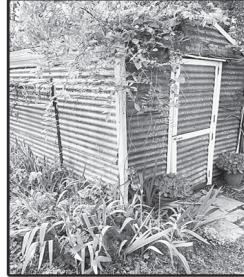
Iris and wisteria at the Cottage Garden