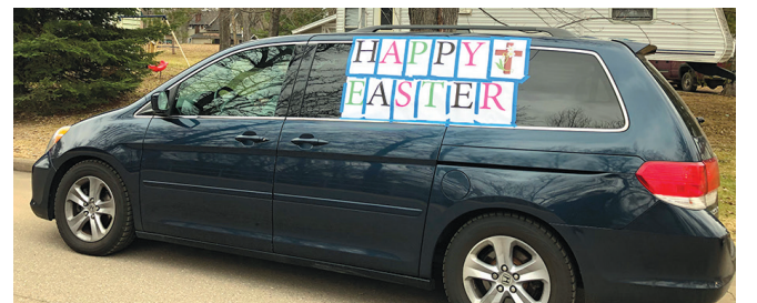
Cars and trucks paraded around Aitkin to cheer staff and residents at senior living centers and the Aitkin hospital.

who were alone, wisdom for leaders on all levels, hope for families and health care professionals.