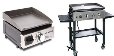
Table Top Griddle & Griddle 28" & 36"