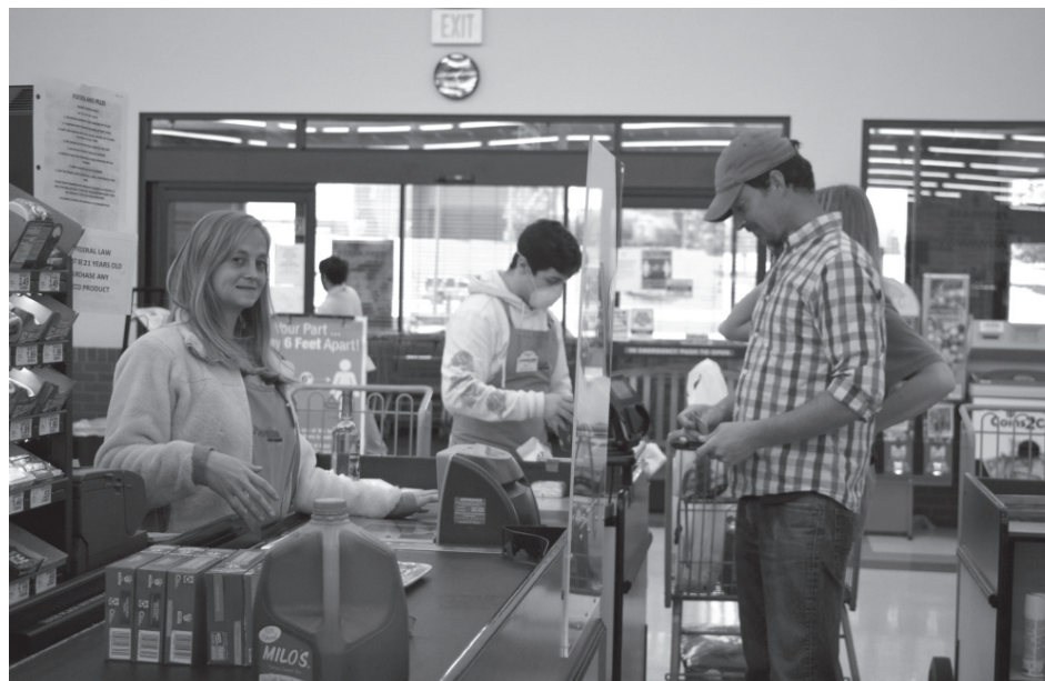
The quick work from the cashiers is one reason for Foodland being the Best of the Best.

During the pandemic, Foodland is taking some extra measures in