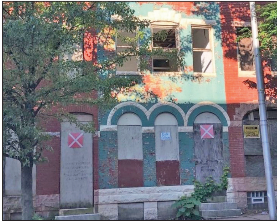
The efforts of the The Druid Heights Community Development Corporation to demolish legendary Cab Calloway's house located in the 2200 block of Druid Hill Avenue for revitalization of the neighborhood have been stymied by a costly legal battle. Among the multi-million dollar, much-needed makeover of the neighborhood is a park honoring Calloway.

They argue that the home is not Michael Jackson's Neverland or Elvis Presley's Graceland but forever unkempt and uncared for, it must be demolished along with other properties, so plans to beautify the neighborhood can continue. Among the multi-million dollar and