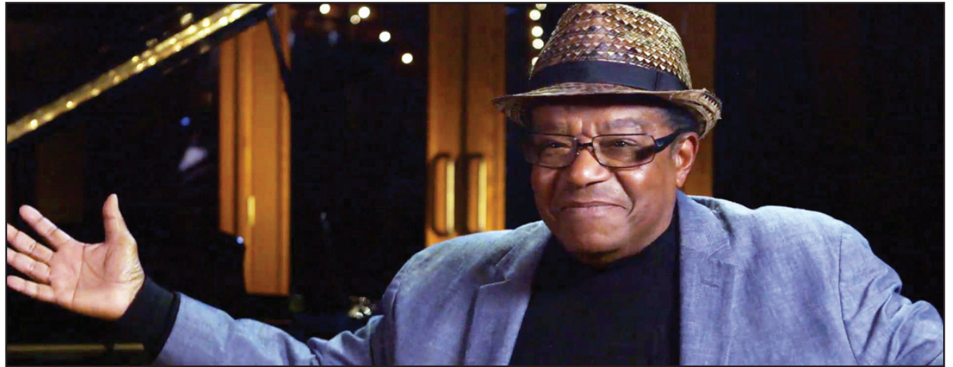
Little Anthony of hit-making doo-wop group Little Anthony and The Imperials in doc "Streetlight Harmonies."

A high-flying television appearance by Frankie Lymon and The Teenagers was