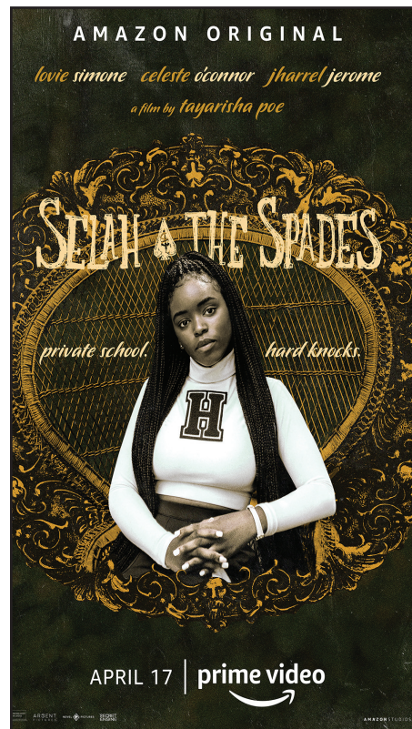
Selah and the Spades debuted on Amazon Prime on April 17, 2020