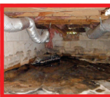
Nasty Crawl Space