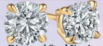
Diamond Stud Earrings

Lowest Prices Largest Selection In The TN Valley