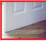
Doors Not Opening Properly