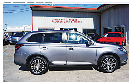
2018 Mitsubishi Outlander SE FWD #9F0008A.....$17,997