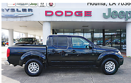
2019 Nissan Frontier SV 2WD Rear Wheel Drive Crew Cab #11341.....$21,497