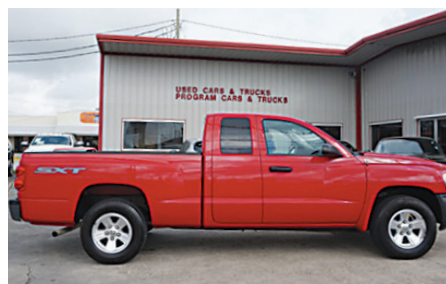
2008 Dodge Dakota Bighorn/Lonestar 2WD Rear Wheel Drive Extended Cab #11364.....$10,997