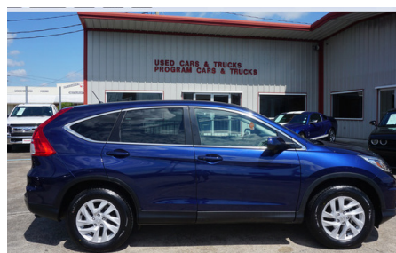
2016 Honda CR-V EX 2WD Front Wheel Drive 4 Dr SUV #9D0097A.....$18,997