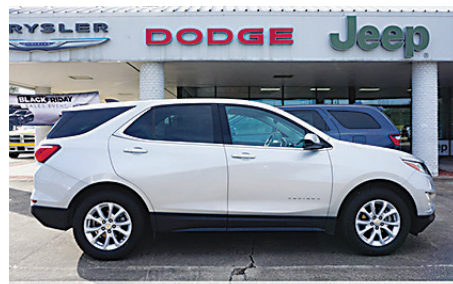
2018 Chevrolet Equinox LT AWD #T0317.....$18,497