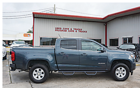
2019 Chevrolet Colorado Work Truck 2WD 128WB Rear Wheel Drive Crew Cab #9T0499A.....$24,997