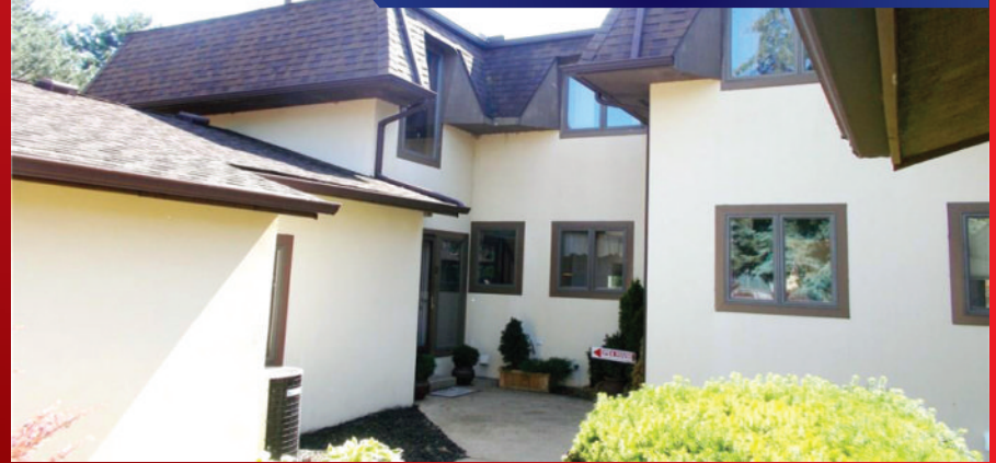
4625 UNIT 2 COMPASS ROSE, VERMILION

Property could have many uses. BUY A LEGEND. This would be great for a restaurant to grow the herbs and flowers they need. There are living quarters in the business plus another home that could be rented out. This property has been maintained. It would also make a great place that cares for your plants in the winter. Wonderful business that has been operational for a long time. This includes the real estate, business fixtures, and an additional home that can be rented out. Beautiful working Green House. Call us for an appointment to view.