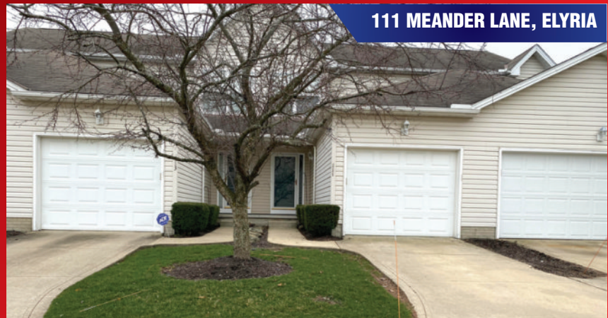
111 MEANDER LANE, ELYRIA

This is a well maintained home that has been lovingly cared for It is very up to date and comfortable.