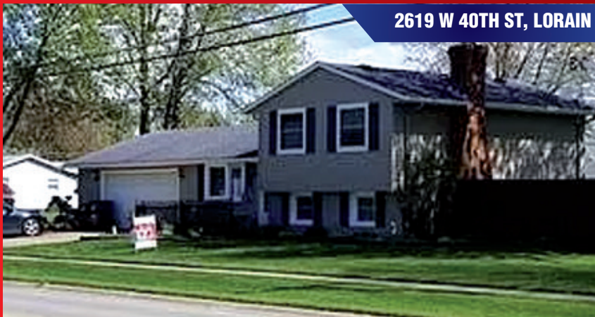
2619 W 40TH ST, LORAIN

This is a lovely townhouse situated in a community that has a pool and beach. Please visit the area, drive around and see the lovely marina and amenities. The area is quiet and homey.