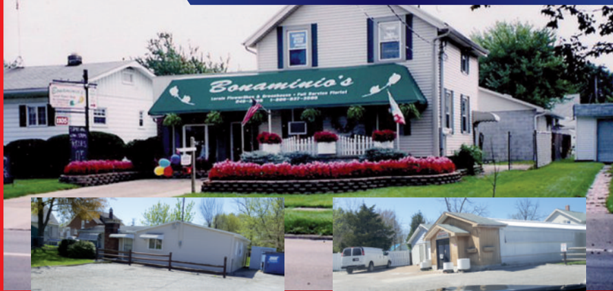
BONAMINIO'S FLOWER SHOP, 1105 WEST 21ST, LORAIN