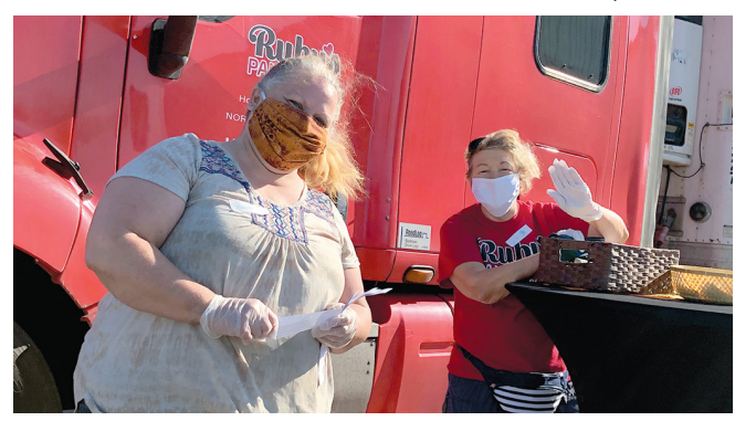
Greeters say hello at the beginning of the food line.