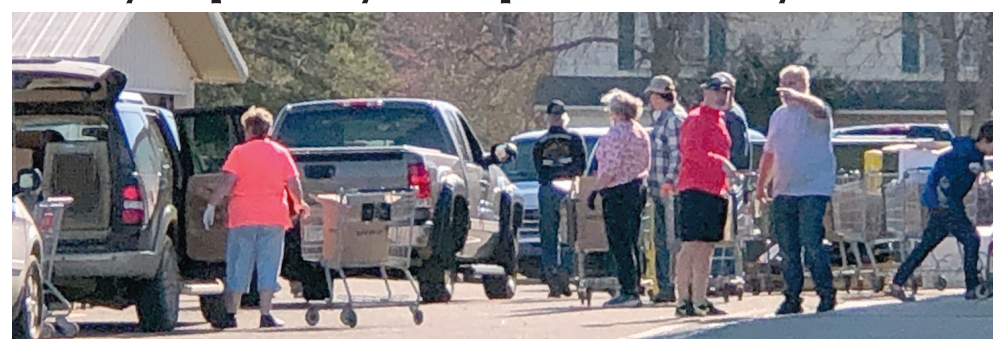
Ruby's Pantry, the household food support program run by the Journey North Church of Aitkin and Brainerd, reopened on May 2. Aitkin's pickup is the first Saturday of the month at 9 a.m. at the Aitkin Church. With social distancing, no customers went inside the building. They stayed in their vehicles, got in the line and paid $20. Various volunteers loaded food into vehicles. Households get about $100 of food for each $20 share that they buy. About 233 shares were distributed in May. Above: A small army of volunteers kept the Ruby's shares flowing to customers that waited in there vehicles.

will be an-Ruby's pantry reopened May 2 nounced shortly." Both kitch-