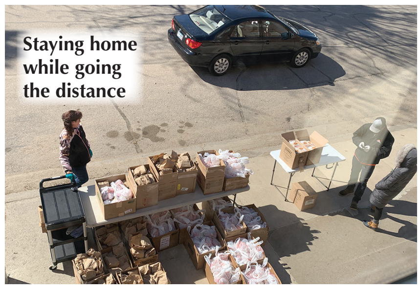
Food is ready for families at a Grab n Go site.