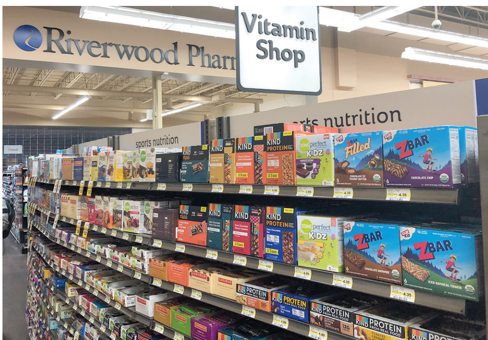
The new Riverwood Healthcare Pharmacy at Paulbeck's County Market should open in early July. Over-the-counter products are available in the new addition near the market's checkout area.

The next step is to safely reopen all patient services.