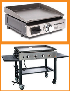
Table Top Griddle & Griddle 28" & 36"