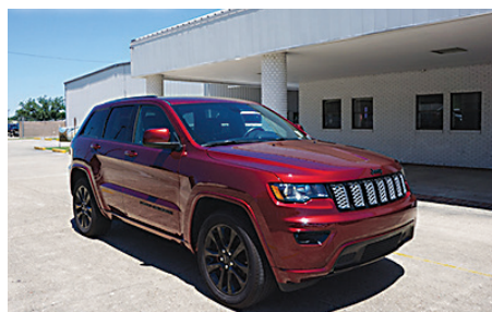
2019 Jeep Grand Cherokee Altitude 2WD With Navigation