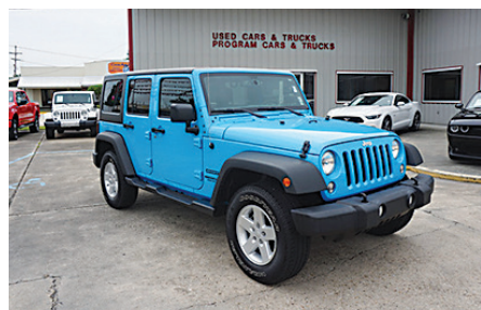
2017 Jeep Wrangler Unlimited Sport 4WD