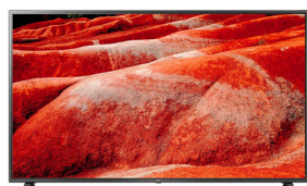
82" LG TV ON SPECIAL!