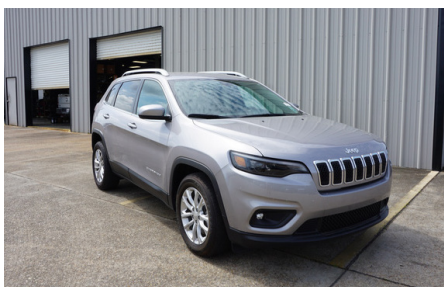
2019 Jeep Cherokee Latitude 2WD