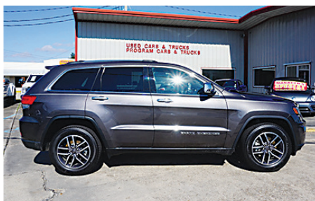
2019 Jeep Grand Cherokee Limited 2WD With Navigation