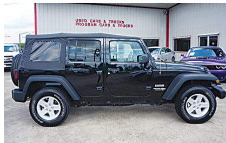
2018 Jeep Wrangler JK Unlimited Sport S 4WD