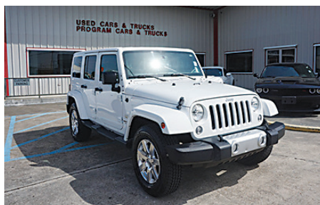
2015 Jeep Wrangler Unlimited Sahara 4WD With Navigation