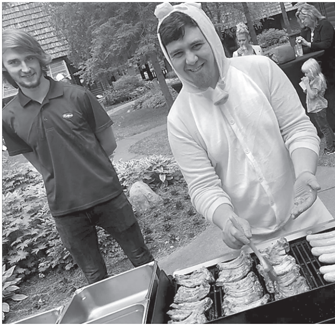
A Whole Hog Pass will admit you to all the Beer and Bacon Events for $25 per person. Call 218-678-4644 to reserve your pass today.

To purchase a Whole Hog Pass and for more information and complete details about Ruttger's Beer and Bacon Bonanza, go to www.ruttgers.com/beer-bacon-bonanza .