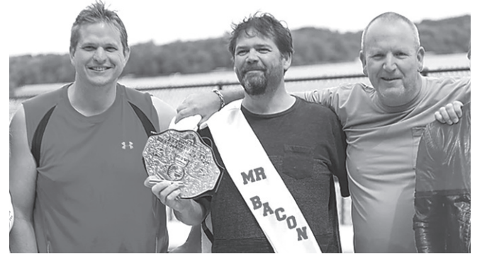
Got the "chops" for it? Enter the Mr. Bacon Beauty Pageant at 3 - 4 p.m. at the outdoor pool.