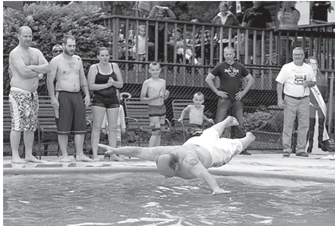
Sign up for the Pork Belly Flop Contest and make a splash from 2 - 2:30 p.m. at the outdoor pool.