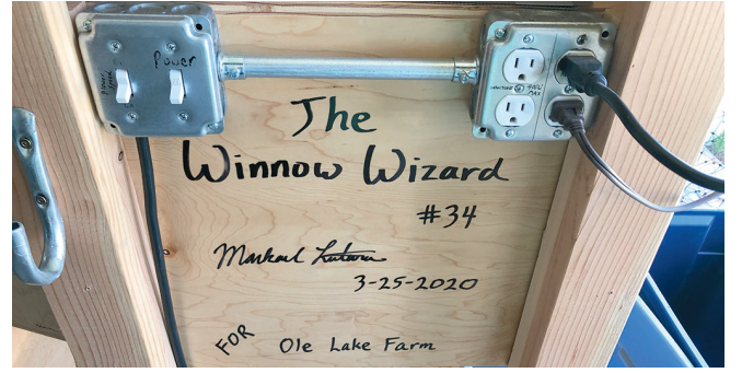
The Winnow Wizard is used for their grain. They grind fresh wheat and rye flower and cornmeal for their customers. "Our cornmeal tastes like corn," Debby emphasized.

and the Sprout indoor garden in the winter in the Little Falls area.