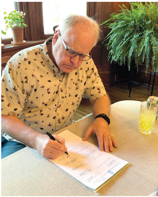
Governor Tim Walz signed H.F. 5 into law on June 16. The bill is set to aid Minnesota's economic recovery by providing $62.5 million in grants for small businesses impacted by COVID-19.

Governor Tim Walz signed H.F. 5 into law on June 16. This bipartisan bill will aid Minnesota's economic recovery by providing $62.5 million in grants for small businesses impacted by COVID-19.