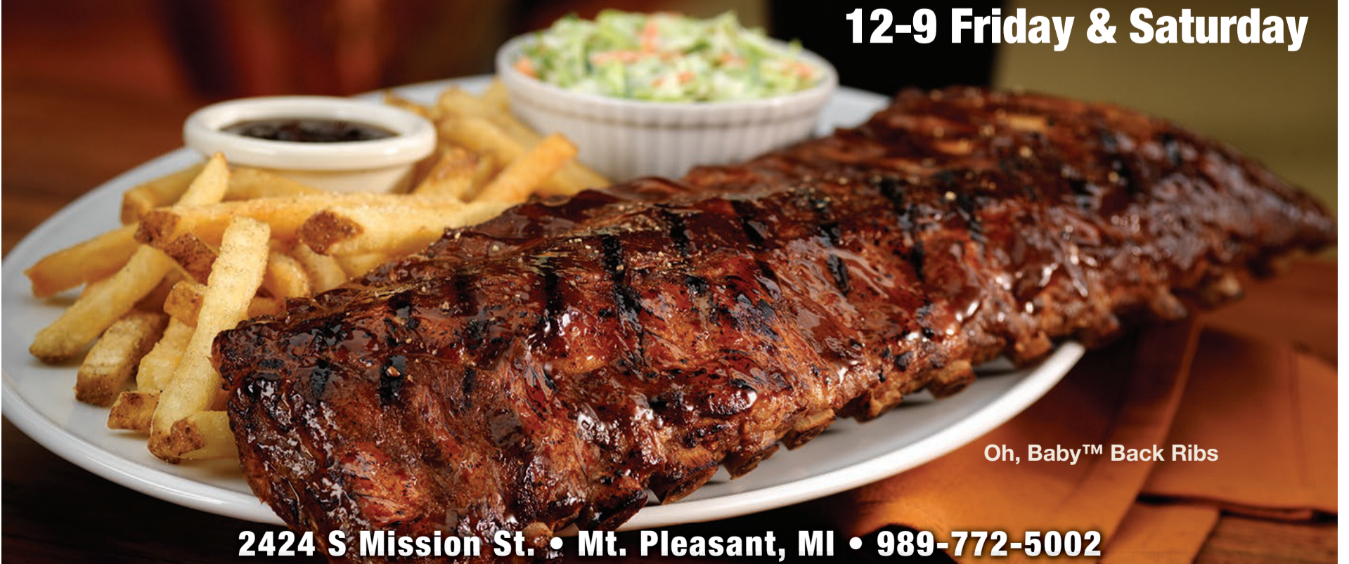
Oh, Baby™ Back Ribs

Dine In Hours: 12-8 Sunday -Thursday 12-9 Friday & Saturday