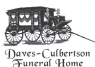
Daves-Culbertson Funeral Home