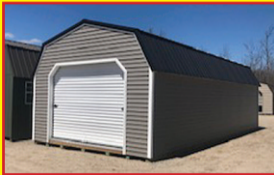
14x32 High Barn Side Entry, 8 Ft. Loft, 1 - 3x3 Window $6,830

DON'T WASTE YOUR SUMMER VACATION TRYING TO BUILD YOUR OWN STORAGE BUILDING. COME SEE US! WE WILL BUILD IT FOR YOU!