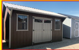
12x16 Quaker $3,870