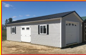
14x32 Gable 3 Insulated Windows, 6 Ft. Side Door, 4 Ft. Loft, Insulated Garage Door $7,772