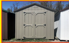
8x10 Bargain Barn $1,360