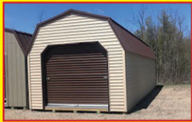
12x28 High Barn 8x7 Door, 8 Ft. Loft, 3x3 Window $5110