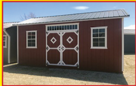
12x20 Gable 3 Windows, 2 - 4 Ft. Lofts $3,971