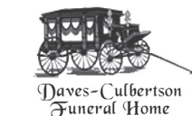
Daves-Culbertson Funeral Home