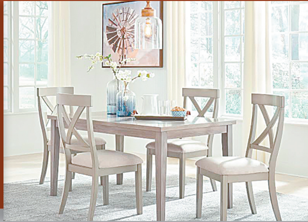
Dining - D261, D291 (Same Item In Square & Rectangle) 4 Chairs