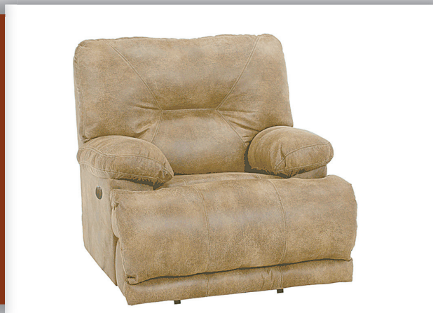
Recliner - Catnapper Brandy Voyager, W647