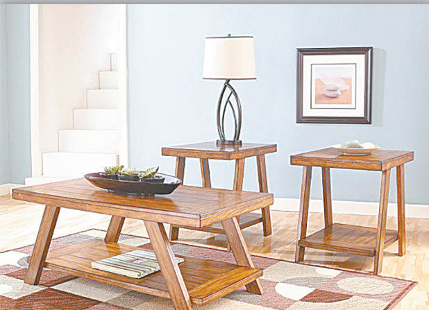
Occasional - T392, W647