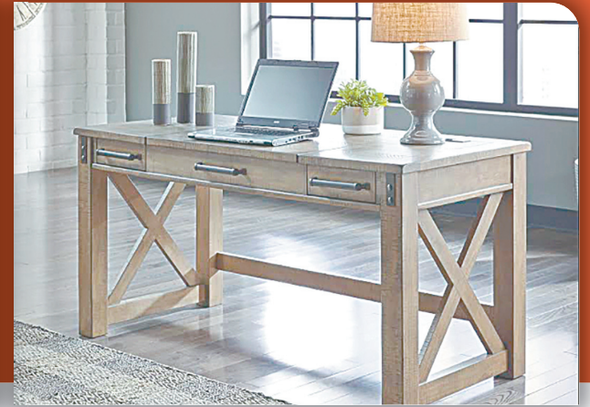
Office - H837