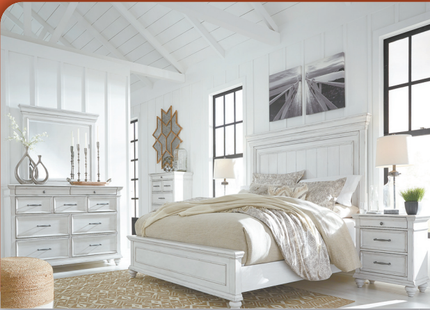
Bedroom - B777 - Queen Beds Plus Several Other Items