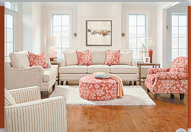
Seating - Fusion Logevity Muslin Sofa/Love

105 N Jackson St., Tullahoma Financing and Lay-A-Way available WAC Hours: Monday-Saturday: 10:00am-6:00pm - Closed Sunday