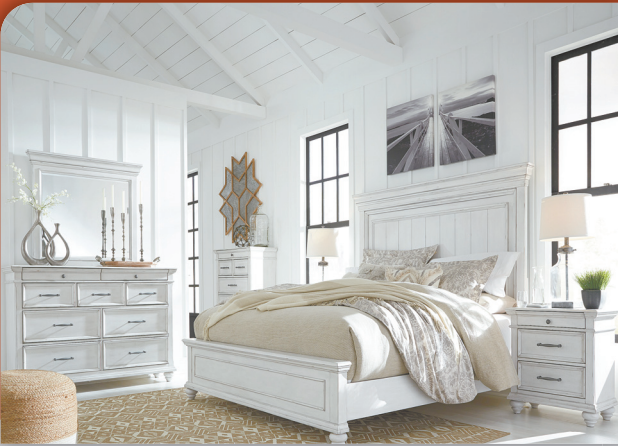
Bedroom - B777 - Queen Beds Plus Several Other Items