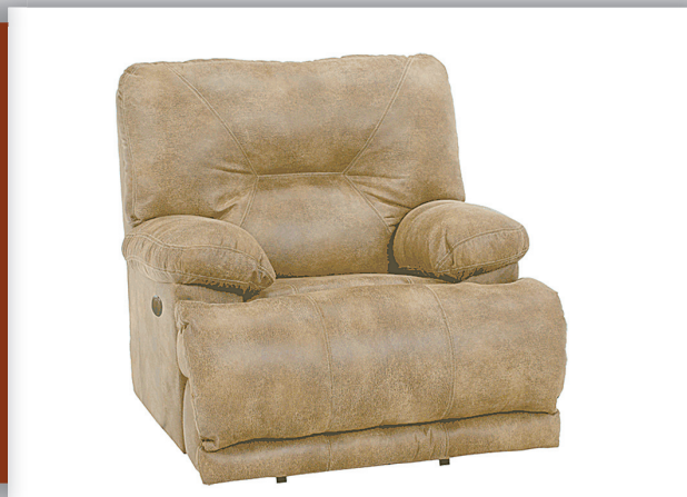
Recliner - Catnapper Brandy Voyager, W647