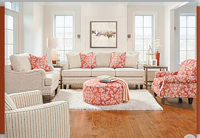
Seating - Fusion Logevity Muslin Sofa/Love

105 N Jackson St., Tullahoma Financing and Lay-A-Way available WAC Hours: Monday-Saturday: 10:00am-6:00pm - Closed Sunday