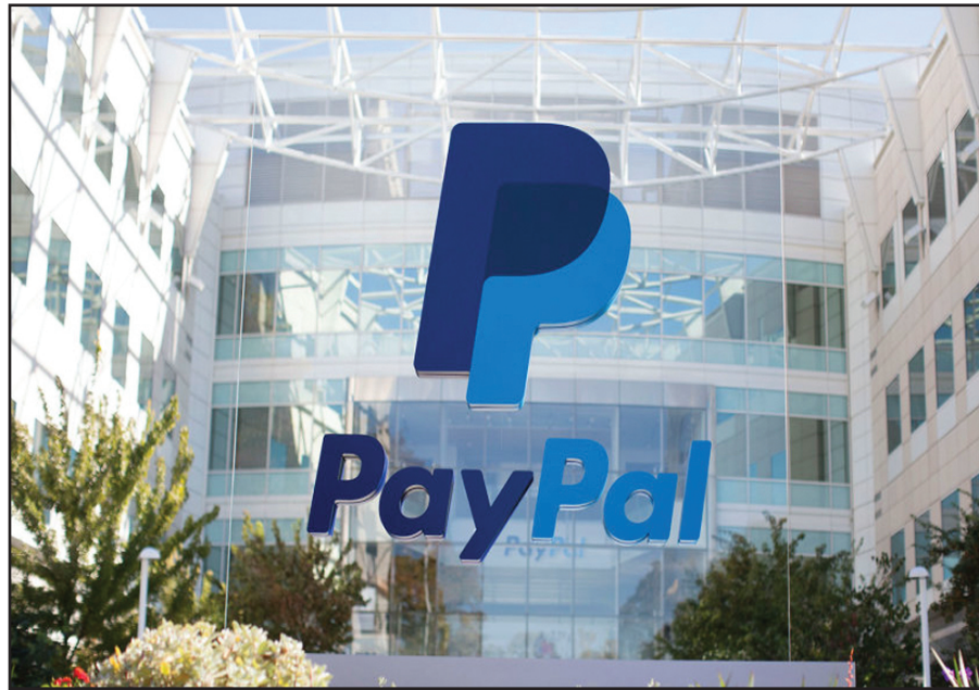
PayPal Holdings has committed a $530 million to support black and minority-owned businesses and communities in the United States, especially those hardest hit by the pandemic.

*$10 million fund for empowerment grants to black-owned businesses impacted by COVID-19 or civil unrest. These grants will provide direct support to business owners to cover expenses related to stabilizing and reopening their businesses. The fund will be managed in partnership with Association for Enterprise Opportunity, a leading national nonprofit expanding economic opportunity for Black entrepreneurs through its Tapestry Project. Interested businesses can apply for a grant at aeoworks.org/paypalgrant/ .