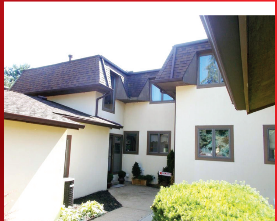
4625 UNIT 2 COMPASS ROSE, VERMILION