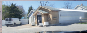
BONAMINIO'S FLOWER SHOP, 1105 WEST 21ST, LORAIN