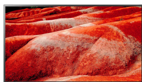
82" LG TV ON SPECIAL!