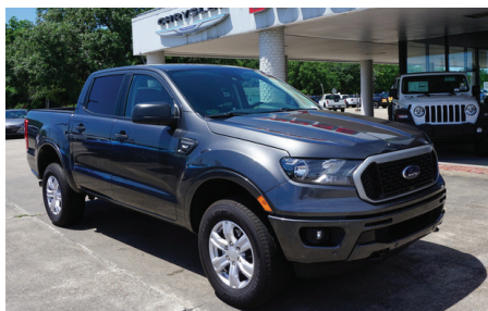
2019 Ford Ranger XLT #T0C001A.....$27,997