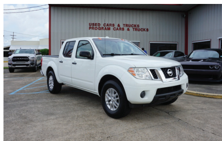
2015 Nissan Frontier SV #0T0091A.....$16,997