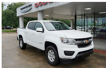
2018 Chevrolet Colorado Work Truck #T9D021B.....$22,997