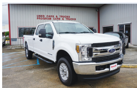
2019 Ford F-350 XLT SD #11402.....$46,997