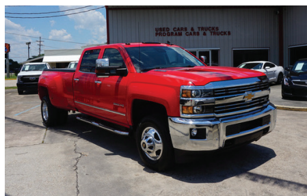
2016 Chevrolet Silverado 3500HD LTZ #0T0130A.....$49,997