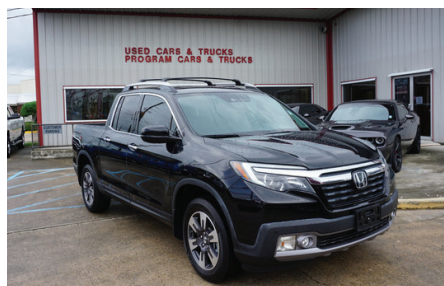
2019 Honda Ridgeline RTL-E #11210A.....$33,497